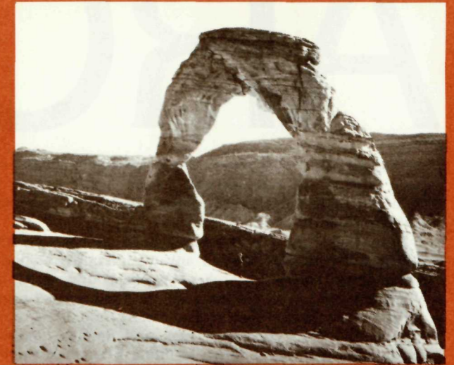
ARCHES NATIONAL PARK · UTAH

☆ U.S. GOVERNMENT PRINTING OFFICE: 1972-483-421/62 REVISED 1972