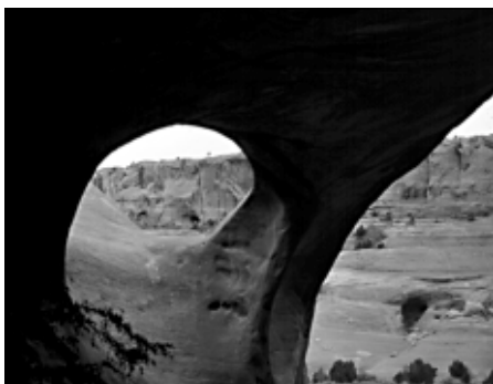
Cavern Arch, Lost Spring Canyon

You can reach Lost Spring Canyon by hiking from within Arches, or by driving to the canyon's rim from Interstate 70 near Thompson. Both routes take about two hours travel time from the park entrance. You'll want a full day to explore this marvelous area.