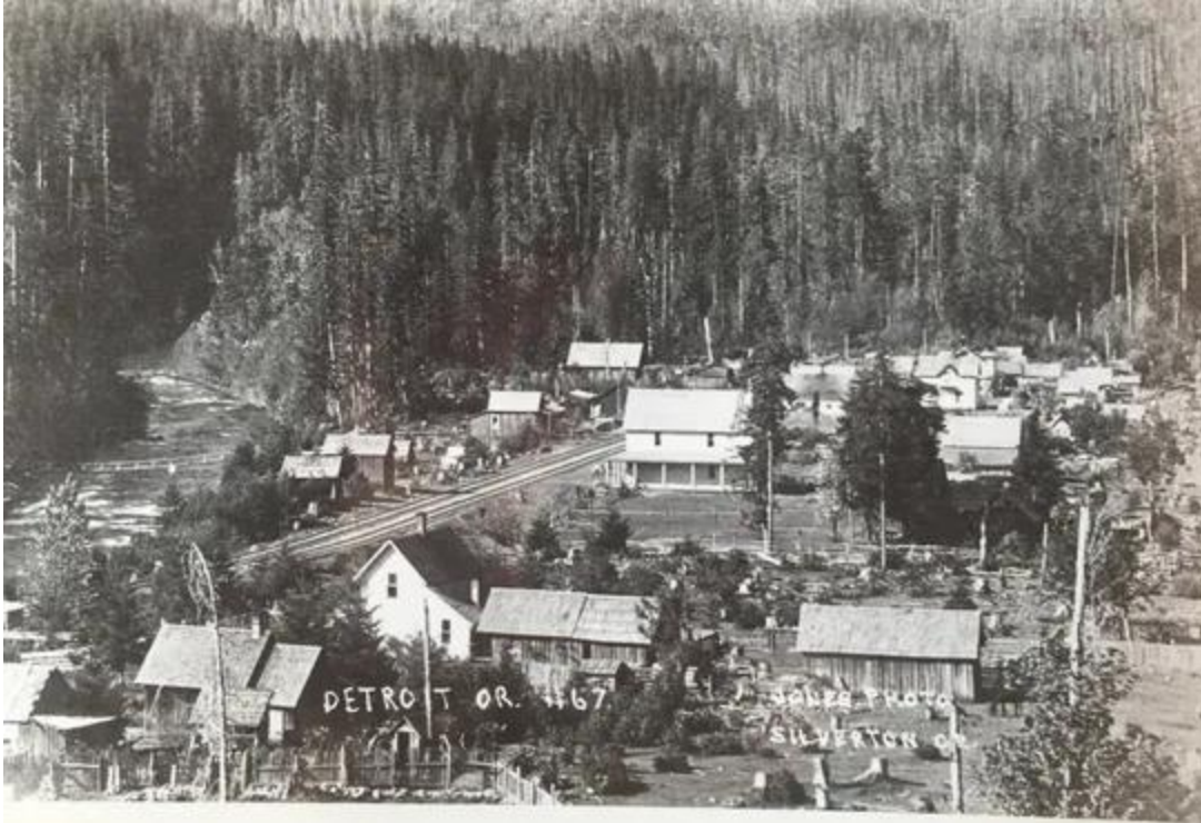
Old Detroit existed from 1880 to 1952, born as a railroad construction camp for workers who built the Oregon Pacific Railroad deep into the state's forestland.

The wagon was built by the Milburn Wagon Company in Toledo, Ohio, around the turn of the 20th century. With extra spokes, metal encased hubs, and a special 'Oregon brake,' it was built to engage rough terrain. Business owners in the present Detroit approached the USFS about excavating the wagon and putting it on display. But displaying it is likely impossible. "The issue is that in trying to remove it, it would just fall apart," said Kelly. It has only been the low-oxygen environment that's preserved it.