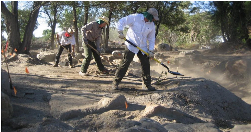
Dust flies as volunteers dig out the upper pond at Merritt Park, the largest garden in Manzanar.

Since 2003, Manzanar's Community Archeology Program has provided a unique platform for volunteers to learn about the personal and political consequences of racism within a historical context. Through archeology and historic preservation projects, volunteers are discovering, documenting, and restoring landscape features that tell the stories of Manzanar to more than 100,000 visitors per year.