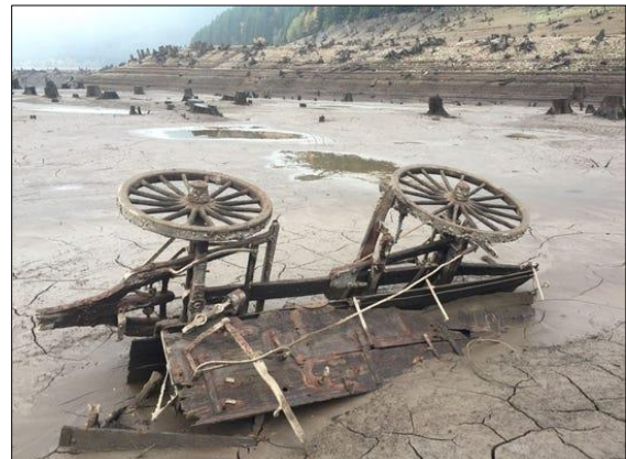
The "ghost wagon"

A historic drought in 2015 and repairs to the Detroit Dam's spillway gates in December 2019 dropped Detroit Lake, Oregon, to levels low enough to reveal a "ghost wagon" in a ghost town. The lack of snowfall caused water levels in 2015 to drop to the lowest they've been in almost 50 years, approximately 143 feet below capacity. Low water levels on these two recent occasions revealed house foundations, fish ponds, and other relics of the railroad town of Old Detroit, including a horse drawn wagon.