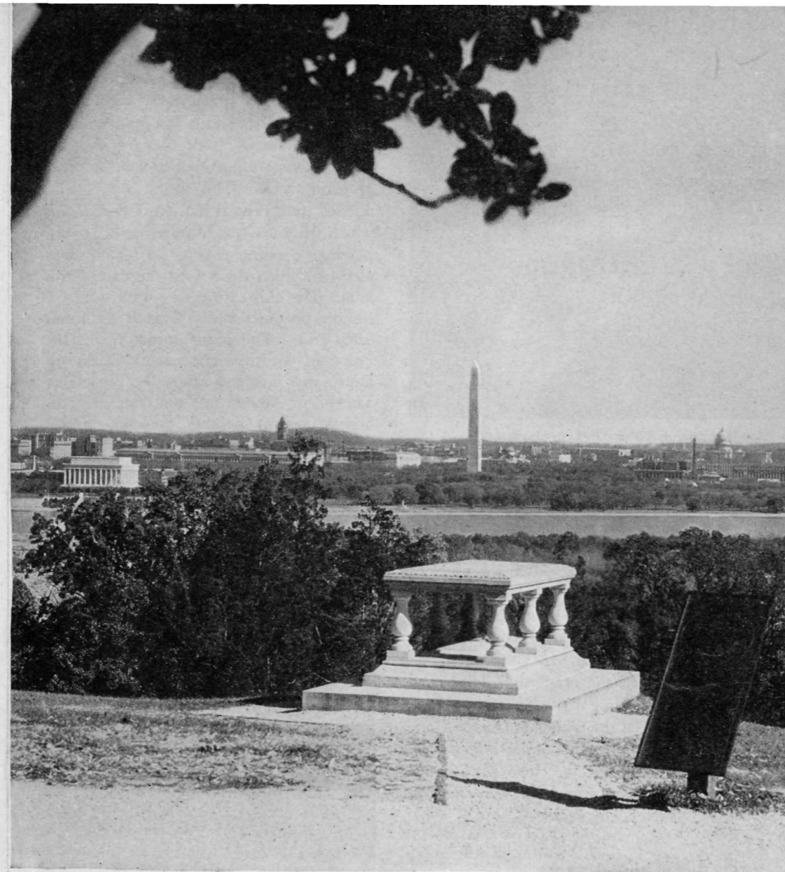
Lee Mansion overlooks the city of Washington