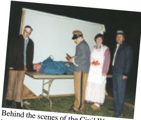
Behind the scenes of the Civil War "tent hospital," where an amputation was silhouetted on the tent canvas backdrop.