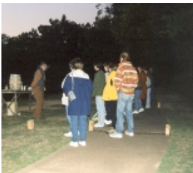
A total of almost five-hundred visitors attended the Ghosts of the Past programs.