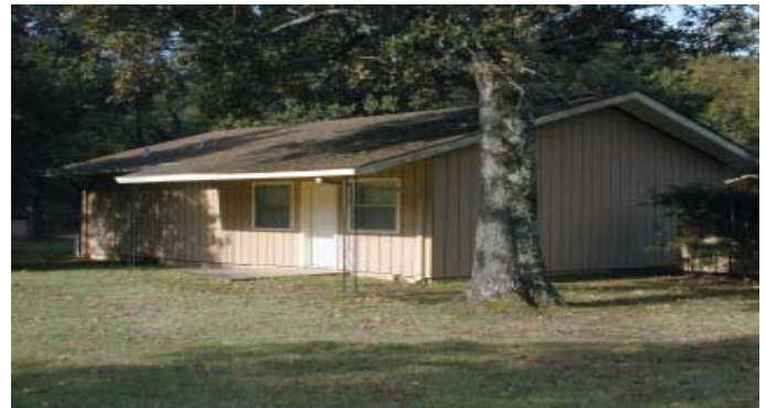
Maintenance Office (remodeled visitor center)

The rapport he established with the youth hired each summer while teaching them leadership and good work skills is evident in the fact that many of them return annually to visit with him. In addition to supervising up to seven youth program employees each summer, he also supervises a permanent staff of three. His generosity was spread throughout the nation as he fought wildland fires in Washington and donated over four weeks of personal leave to those less fortunate in the National Park Service family.