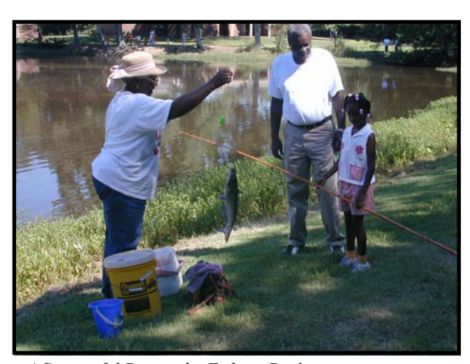
A Successful Day at the Fishing Derby