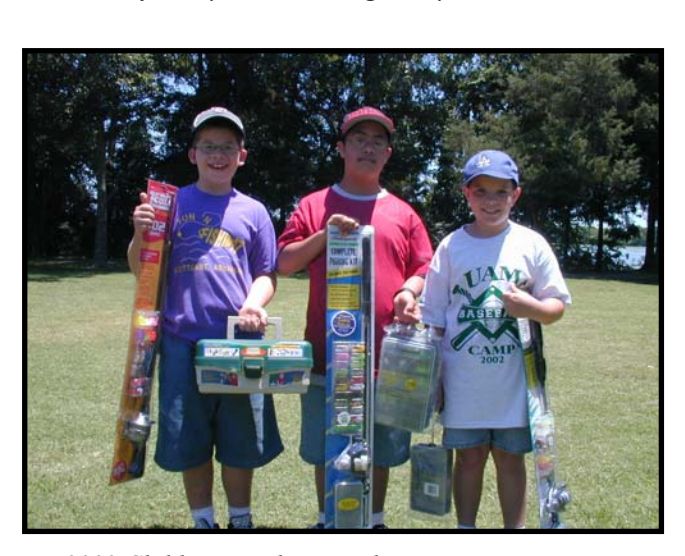
2002 Children's Fishing Derby winners