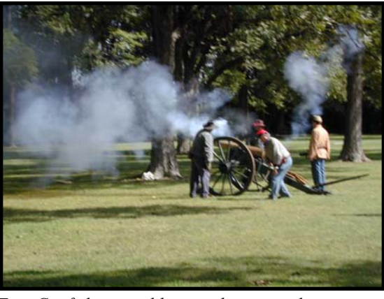
Top: Confederate soldiers and visitors observe a program during the Civil War encampment