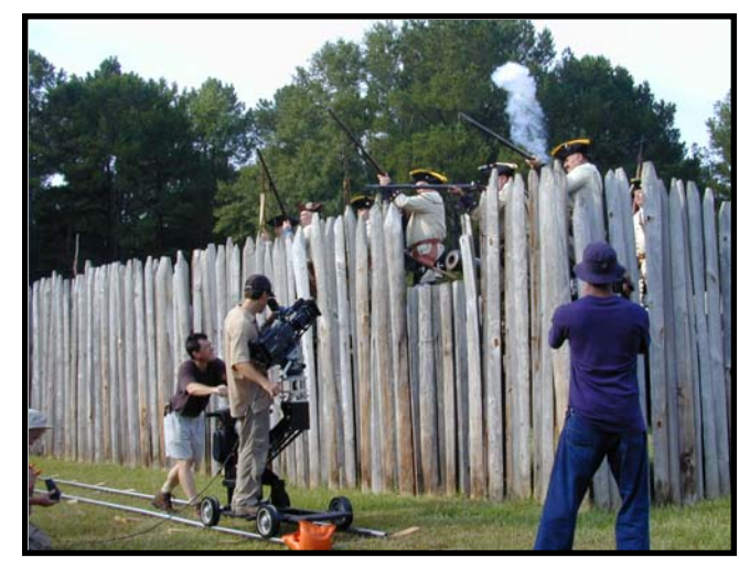
Action! Filming French Marines along the wall of Fort Toulouse, AL

Former park historian Brian McCutchen has been actively involved in the project as historical consultant. To view additional pictures and video clips from the film, take a look on the park web site: http://www.nps.gov/arpo/