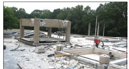
The last of the four skylights – concrete saws and jackhammers were used in the removal.

(Continued "Visitor Center Repairs" on page 2)