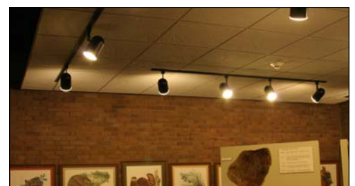
A new drop ceiling and track lighting were installed.