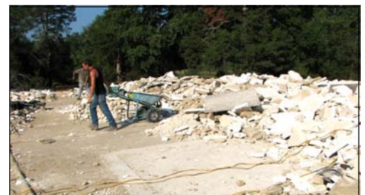
It took four full-size dumpsters to remove the foam and membrane debris from the worksite.