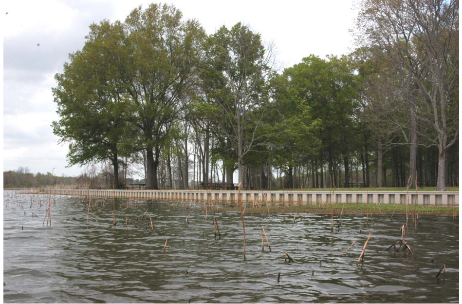
Recycled materials were used to construct the new retaining wall at the Picnic Area.

In accordance with the National Historic Preservation Act, the project was reviewed to ensure that cultural resources such as Civil War or prehistoric artifacts would not be impacted. And since the work would involve changing the shoreline along the bayou, a permit was obtained from the Army Corps of Engineers.