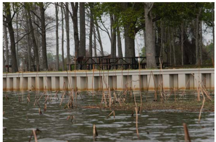
Plastic sheet pilings and an aluminum cap give the new retaining wall a cleaner, more uniform look.