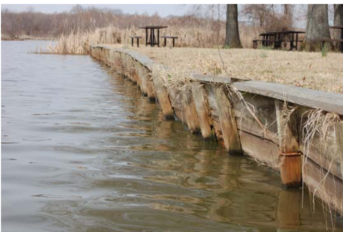
Old retaining wall was rapidly deteriorating.