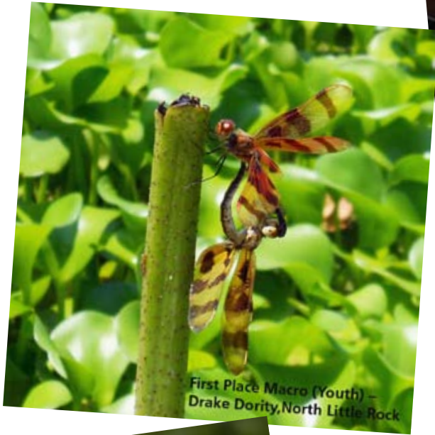
First Place Macro (Youth) – Drake Dority, North Little Rock