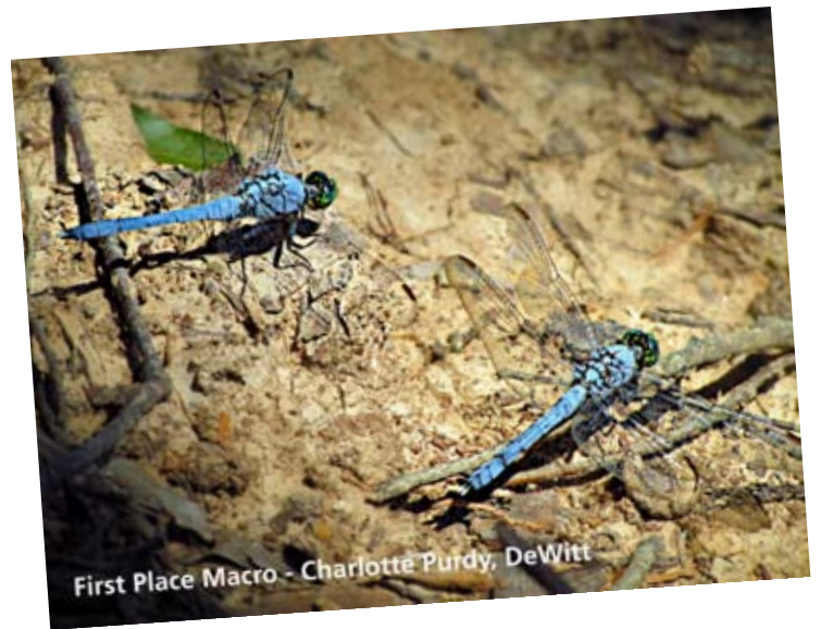
First Place Macro - Charlotte Purdy, DeWitt