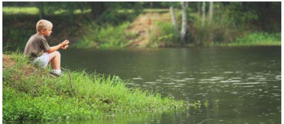
2011 Digital Photography Contest: First Place Recreation (Youth) Jeremy Smith (Dumas)

Grounds and Picnic Area Hours Daily 8:00 a.m. to dusk