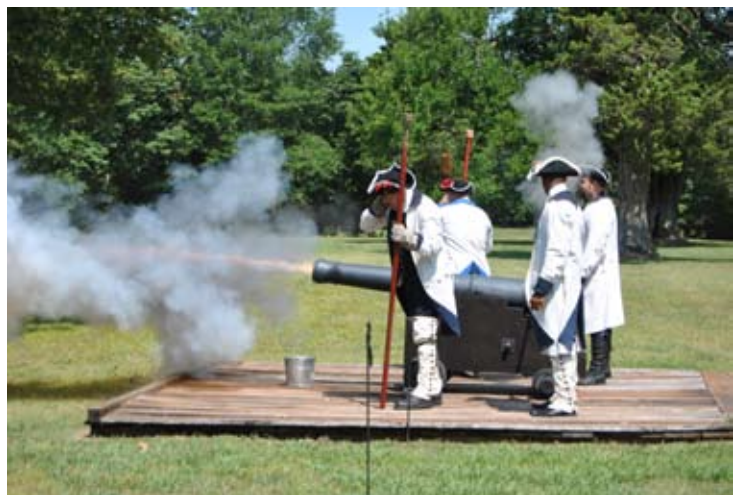
2012 Digital Photography Contest: First Place Historical Photo by Melissa Grantham (Tichnor)The next cannon firing will take place on Colonial Kids Day, July 21.