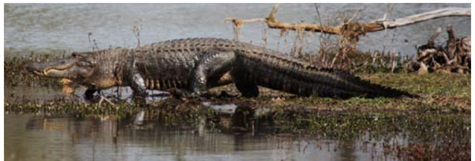
2011 Digital Photography Contest: First Place Wildlife (Youth) Jeremy Smith (Dumas)

Since we have had to cancel previous fall floats due to excessive vegetation, the program this year will be pushed back into December. Dates will be announced soon.