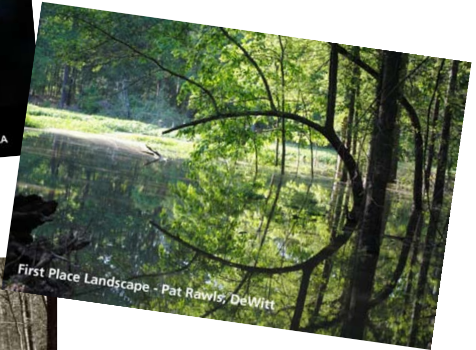
First Place Landscape - Pat Rawls, DeWitt