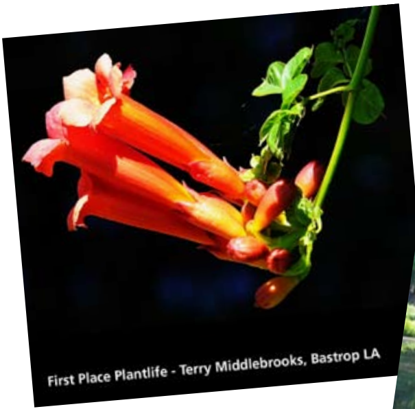
First Place Plantlife - Terry Middlebrooks, Bastrop LA

See more winning photos on pages 1 and 2.