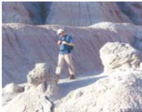
Several park trails such as the Castle Trail will be improved for visitor safety and accessibility.

Consumer Reports has listed the U.S. national parks as a family "best buy." Remember your entrance receipt is good for seven days of exploration. We continue to be a bargain for your vacation.