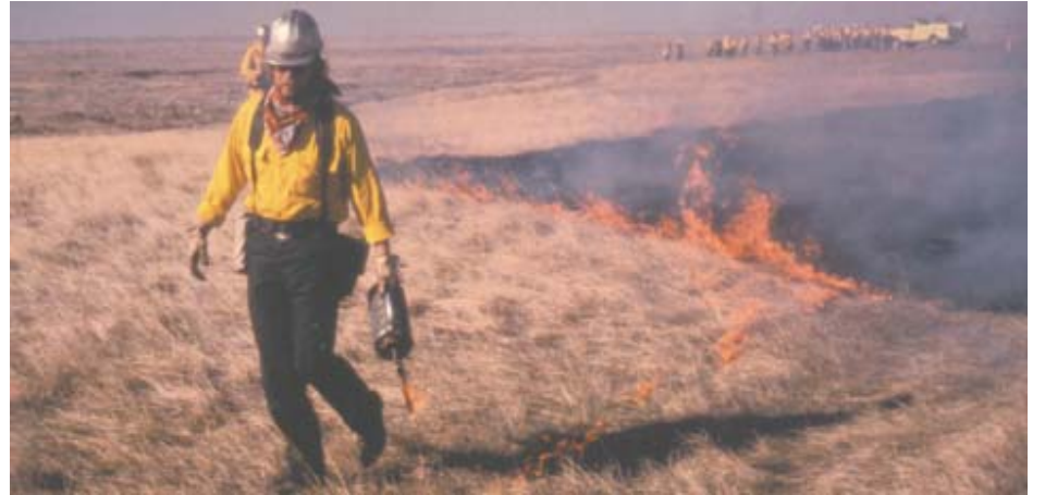
A National Park Service wildland fire fighter uses a drip torch to ignite a prescribed prairie fire in Badlands National Park. This fire was conducted to reduce non-native brome grasses.

ONCE COVERING MILLIONS OF ACRES IN THE GREAT PLAINS, NATIVE PRAIRIES LIKE THOSE FOUND in Badlands National Park now cover only 2% of their original extent and are losing ground to non-native plant invaders. Within South Dakota, non-native plant species have increased, creating a much broader management issue and a need for partnerships. Of roughly 460 plant species within the park, a growing list of approximately 100 species are exotic and threaten the native mixed grass prairie ecosystem. While visiting, guess which locations in the park have the highest risk of being introduced to these invaders? Typically, disturbed areas and locations with high human activity have the highest risk for non-natives taking root. Recently the park,