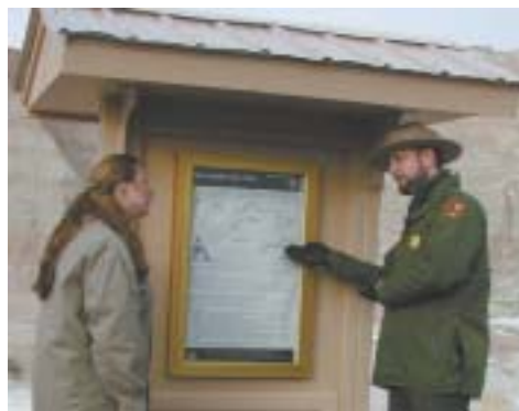
Bulletin boards constructed with user fee money provide better safety and orientation information