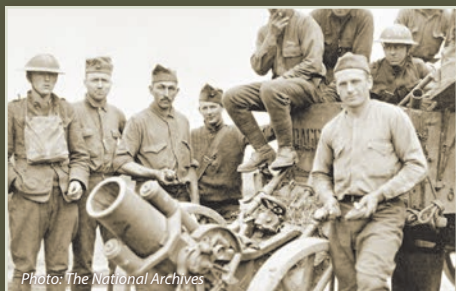
Marines of 2d Battalion, 5th Marine Regiment, with a German trench mortar captured in Belleau Wood.

Two heroic-size figures on the west side depict the unity of the United States and France.