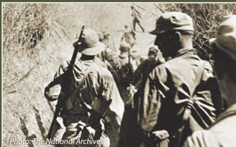
Rangers of 6th Ranger Battalion infiltrated Japanese held terrain to liberate the Cabanatuan POW camp, January 30, 1945.

JULY 5: Liberation of the Philippines declared.