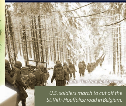
U.S. soldiers march to cut off the St. Vith-Houffalize road in Belgium.

The bronze statue of the Angel of Peace is bestowing the olive branch upon the heroic dead for whom he makes special commendation to the Almighty.