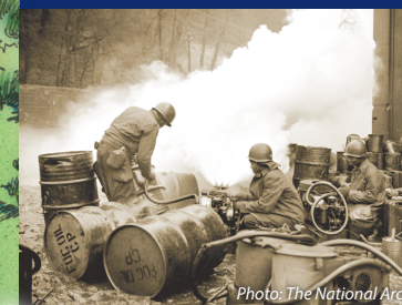
African-American soldiers lay a smoke screen to cover action over the Saar River.

At the cemetery's east end the ground rises to a knoll with the overlook. From it, one views the entire cemetery and the countryside for miles to the west.