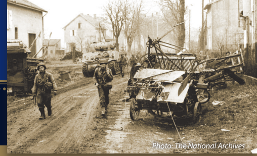
U.S. soldiers pursue German forces on the outskirts of Metz.