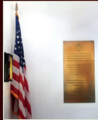
Visitors see the Papua Marker upon entering the U.S. Embassy at Port Moresby.