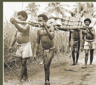
Papua New Guinean natives carry Red Cross blood plasma to front lines to treat wounded soldiers, sailors, and marines.

DECEMBER 31, 1944: The New Guinea Campaign ended.