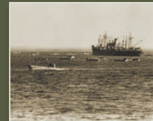
U.S. Navy landing craft of various types swarm about a mother ship off Safi, French Morocco, during American landing operations, November 8, 1942.