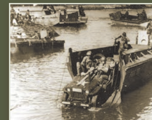
Army Jeep rolling off a Navy landing craft at Fedala harbor during the amphibious operations of the U.S. Western Task Force on November 8, 1942.