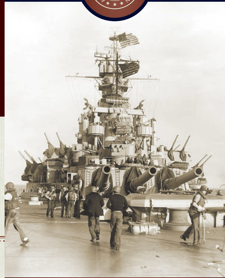
The battleship USS Massachusetts (BB-59) during a lull in the Naval Battle of Casablanca, November 8, 1942.