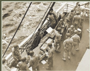
U.S. Army soldiers aboard the transport USS Joseph T. Dickman (APA-13) receive ammunition in preparation for the landing before dawn on November 8, 1942.

NOVEMBER 11: Vichy French resistance in French Morocco ended. They became part of the Free French and joined Allied operations in North Africa.