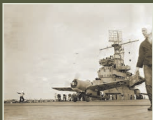
A Grumman F4F-4 Wildcat fighter taking off from USS Ranger (CV-4) to attack targets ashore during the invasion of French Morocco, November 8, 1942.