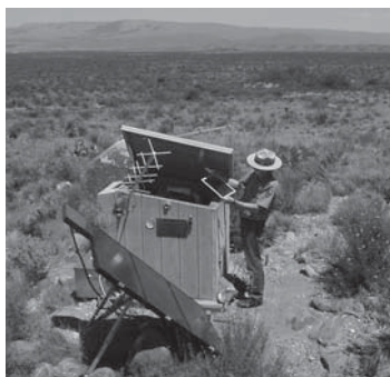
Checking the transmissometer

Determines the amounts of very tiny particles in the air. Current research shows these particles may be very harmful to health, no matter what the particle is made of.