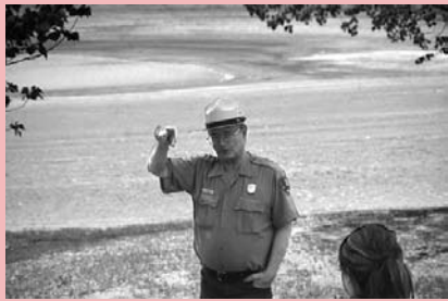
Ranger Program at Horseshoe Bend

During the summer months, visitors can attend weekend programs that include evening campground programs, guided hikes, and ranch tours. Times, locations and dates for these activities vary. Activities will be posted at the visitor centers and campgrounds.