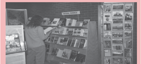
WNPA Sales Area