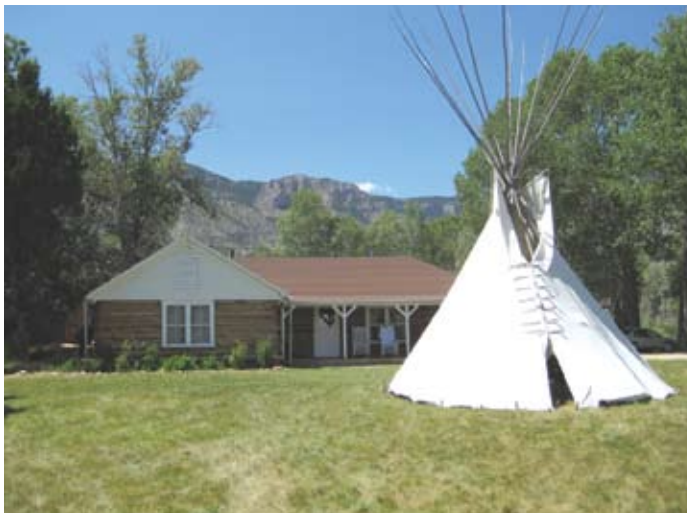
Tipi at Ewing Snell Ranch during the Crow Archeological Field Camp

grow each year. The unique landscape and travel route along the Prehistoric Bad Pass trail system offers students a combination of experiences including academic research, sharing of culture, and resource management.