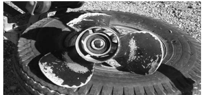
Broken Prop, Photo Courtesy of Friends of Bighorn Lake

Detailed state and federal regulations and park maps are available at visitor centers and ranger stations. Bighorn Lake boating maps are also available on our website at www.nps.gov/bica/playourvisit/map.htm .