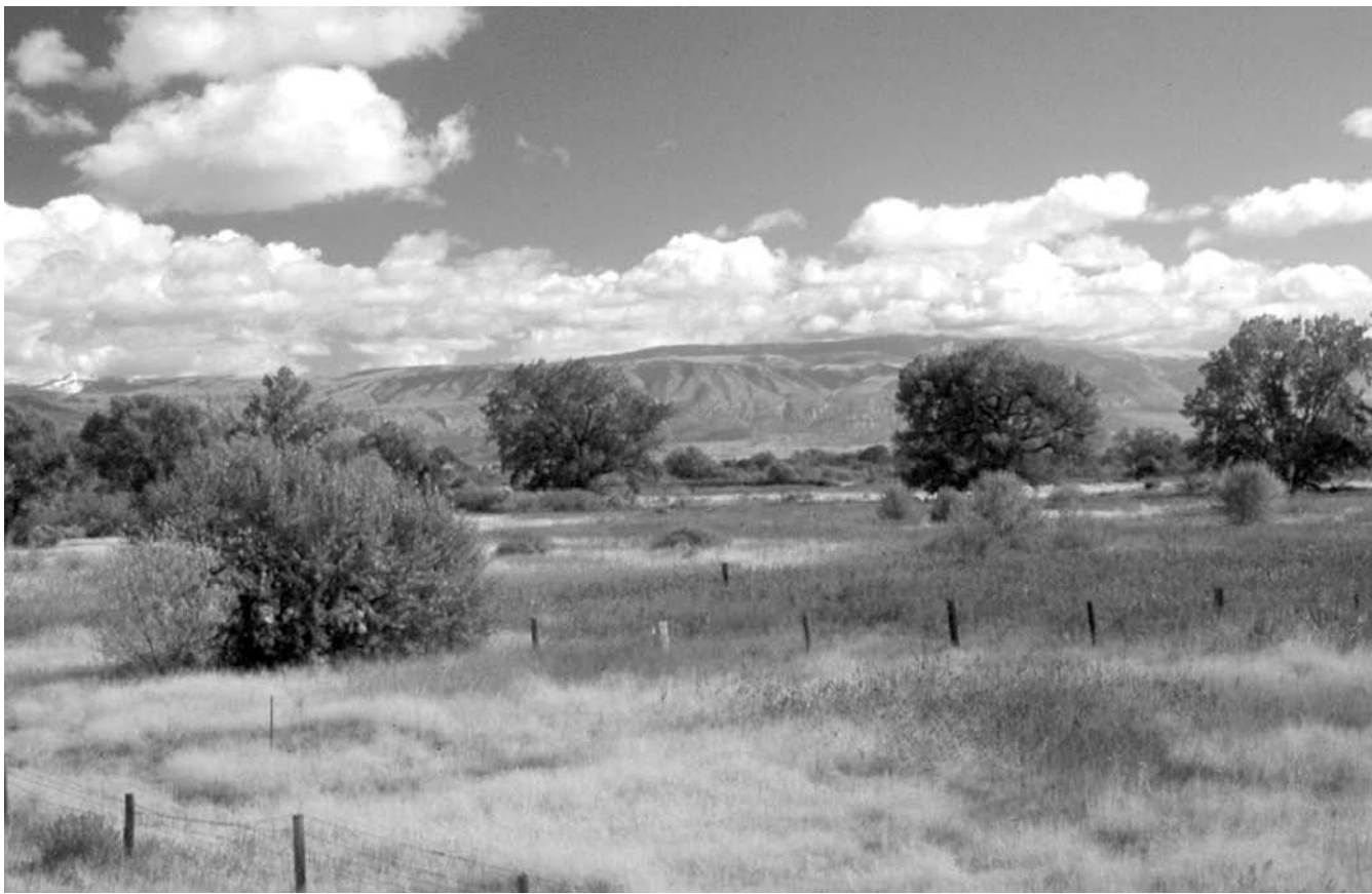
Yellowtail Wildlife Habitat Management Area

The Yellowtail Wildlife Habitat Management area is located six miles east of Lovell, Wyoming. The Habitat is cooperatively managed by Wyoming Game and Fish, National Park Service, Bureau of Land Management, and the Bureau of Reclamation. This area offers one of the best wildlife viewing areas in Bighorn Canyon National Recreation Area.