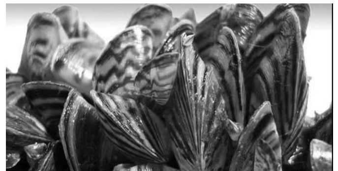
Zebra Mussels

Remove all plants, animals and mud. Then thoroughly wash everything, including all crevices and other hidden areas on your boat and equipment.