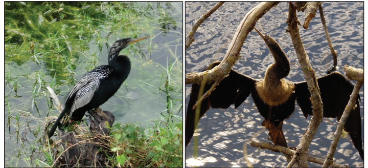
Male anhinga (left) and female anhinga (right)

Look! There’s a snake in the water! Or is it an anhinga? Anhingas are also called snakebirds because of their swimming style. When swimming, only their neck and head stay above the water and their body sinks below the surface. With a quick glance, their long, skinny neck might look like a swimming snake. Cormorants, on the other hand, float on the water’s surface like a duck.