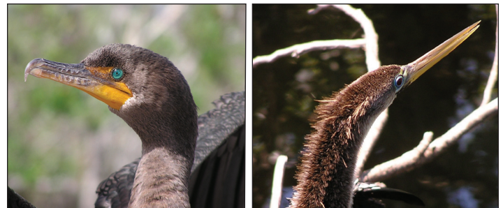
Cormorant (left) Phalacrocorax auritus and aninga (right) Aninga aninga .

If you're still not sure: Take a look at the neck. It's harder to see when not posing side-by-side, but the aninga's neck is longer and skinnier than the cormorants.