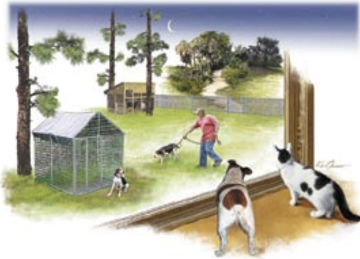
Keep your pets safe and secure. Bring pets inside or keep them in a secure and covered kennel at night.

Free-roaming pets, or pets that are tethered and unfenced, are easy prey for predators, including panthers. Bring pets inside or keep them in a secure and covered kennel at night. Feeding pets outside also may attract raccoons and other panther prey; do not leave uneaten pet food available to wildlife.