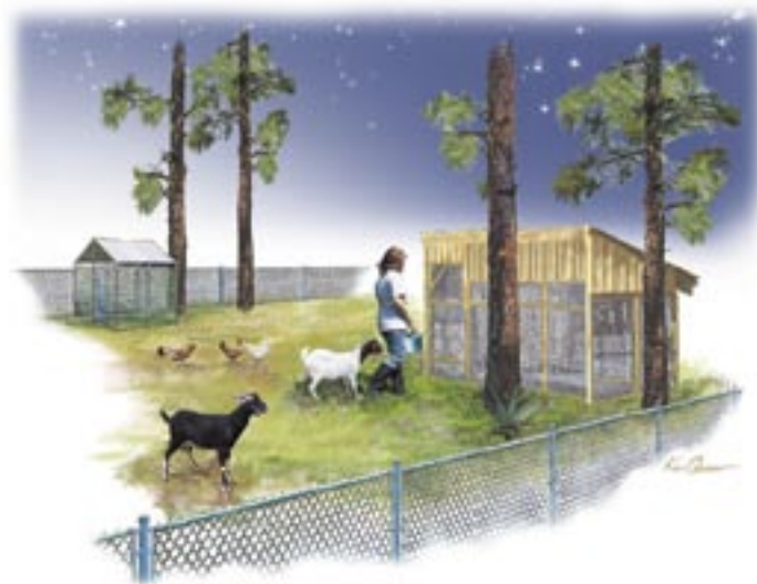
Keep livestock safe and secure.