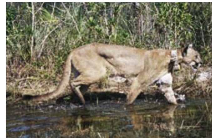
FWC PANTHER TEAM

🐾 Florida panthers' home range sizes vary by sex and by individual. Female home ranges are typically 60-75 square miles whereas males' are typically 160-200 square miles.