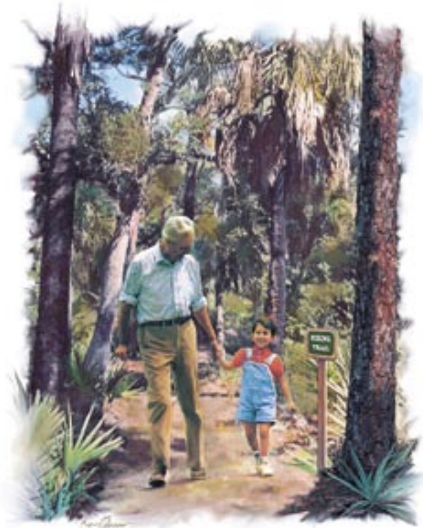
Keep children within sight and close to you, especially outdoors between dusk and dawn.

This brochure contains some guidelines to help you live safely in Florida panther country.