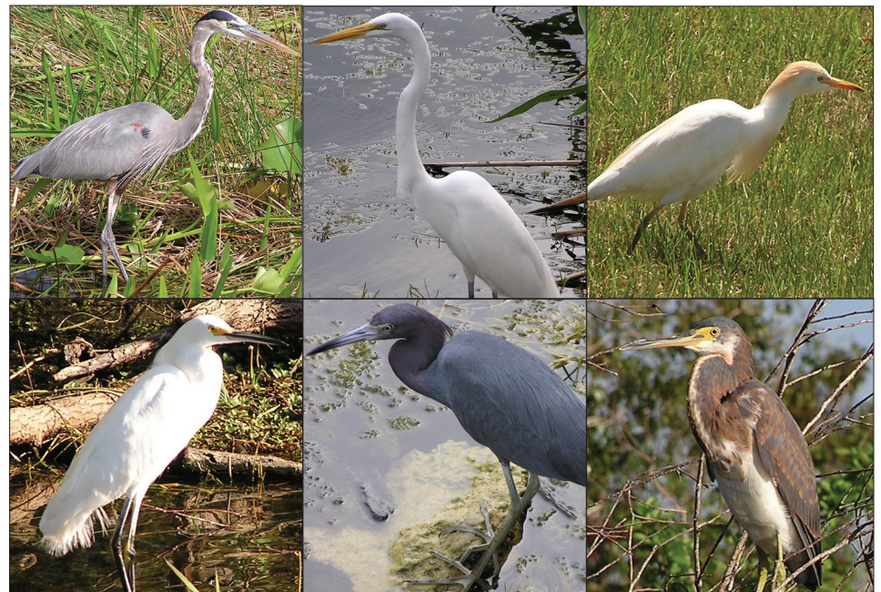
Wading birds of Big Cypress National Preserve. Top (left to right) great blue heron, great egret and cattle egret. Bottom (left to right) snowy egret, little blue heron and tricolored heron.