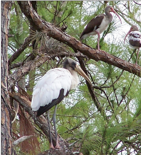
Wood stork (foreground) and immature white ibis resting in a slash pine tree.

Getting the most from your bill doesn't just apply to the dollar. As adults, the white ibis ( Eudocimus albus ) display a white body and brilliantly orange beak with a noticeable downward curve. The immatures have brown wings. These birds forage in the ground and water, using their beak like a needle of a sewing machine. Each stitch probes the ground, providing an opportunity to capture aquatic insects, crustaceans, small fish or amphibians.