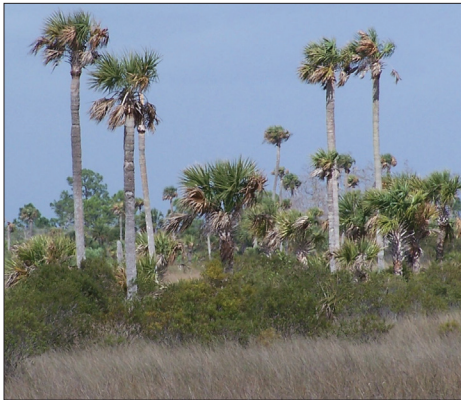
Cabbage palms rising out of the sawgrass.

The canal is only part of the beauty of this area. The sawgrass prairie borders the north side of the canal and the south side of the road. The prairie stretches for miles and offers habitat for a diversity of wildlife. Sawgrass ( Cladium jamaicense ), the dominate vegetation, has a spiny toothed leaf with edges like a saw blade.