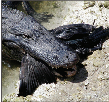
American alligator having a snack (double-crested cormorant) along the canal.

The American alligator ( Alligator mississippiensis ) is the most famous resident and adept predator along Turner River Road. They bask on the canal rims using a combination of sun and water to control their