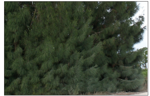
Australian pines are so dense they shade out any plants beneath them.

Mile 11 Take a moment and look to the west, and you may notice a small group of dense trees near the road. The Australian pine ( Casuarina equisetifolia ) is not a true pine nor a native to Florida. Historically planted as a windbreak, this non-native (exotic) is currently under control in the Preserve, but other species thrive in this sub-tropical environment, though they do not have a natural place. Some are invasive, competing aggressively with native species. These introductions, whether accidental or intentional, may damage the natural habitat of natives. By learning more about exotics you can help Preserve managers protect and promote a natural ecosystem.