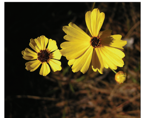
Yellow tickseed ( Coreopsis leavenworthii ) highlights several prairies along the route.

Upper Wagonwheel Road, north of Concho Billie, marks the north side of the loop. As you turn west you follow a different canal with an abundance of aquatic plants as well as the presence of tall grasses like the common reed ( Phragmites australis .) This grass is native to Florida and provides cover to wildlife. Stop a moment and listen. What do you hear? Bird calls are often heard before the birds are seen. Common moorhens ( Gallinula