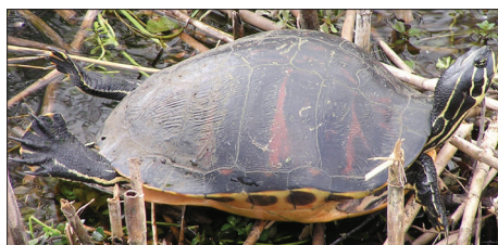
Red-bellied turtle basking in the sun's rays.

Another reptile, which often maintains its own safe distance, is the red-bellied turtle ( Chrysemys nelsoni .) Contrary to what the name implies, the bellies are not always red; the back of the shell has red blotches. These turtles may be seen basking on rocks or resting at the surface of the water and will frequently jump into the water or dive if you approach. Red-bellied turtles eat some insects, but are largely herbivorous, feeding on aquatic plants.