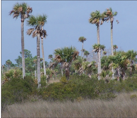
Cabbage palms rising out of the sawgrass.

The canal is only part of the beauty of this area. The sawgrass prairie borders the north side of the canal and the south side of the road. The prairie stretches for miles and offers habitat for a diversity of wildlife. Sawgrass ( Cladium jamaicense ), the dominate vegetation, has a spiny toothed leaf with edges like a saw blade.