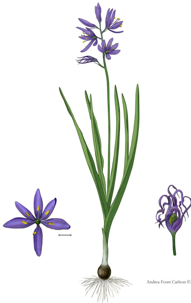
Andrea Foust Carlson © 2005

Natural Resource Data Series NPS/UCBN/NRDS—2015/974