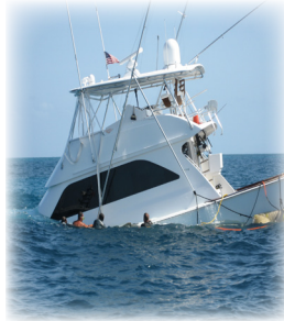
Vessel groundings cause extensive damage to personal property and fragile Park resources.