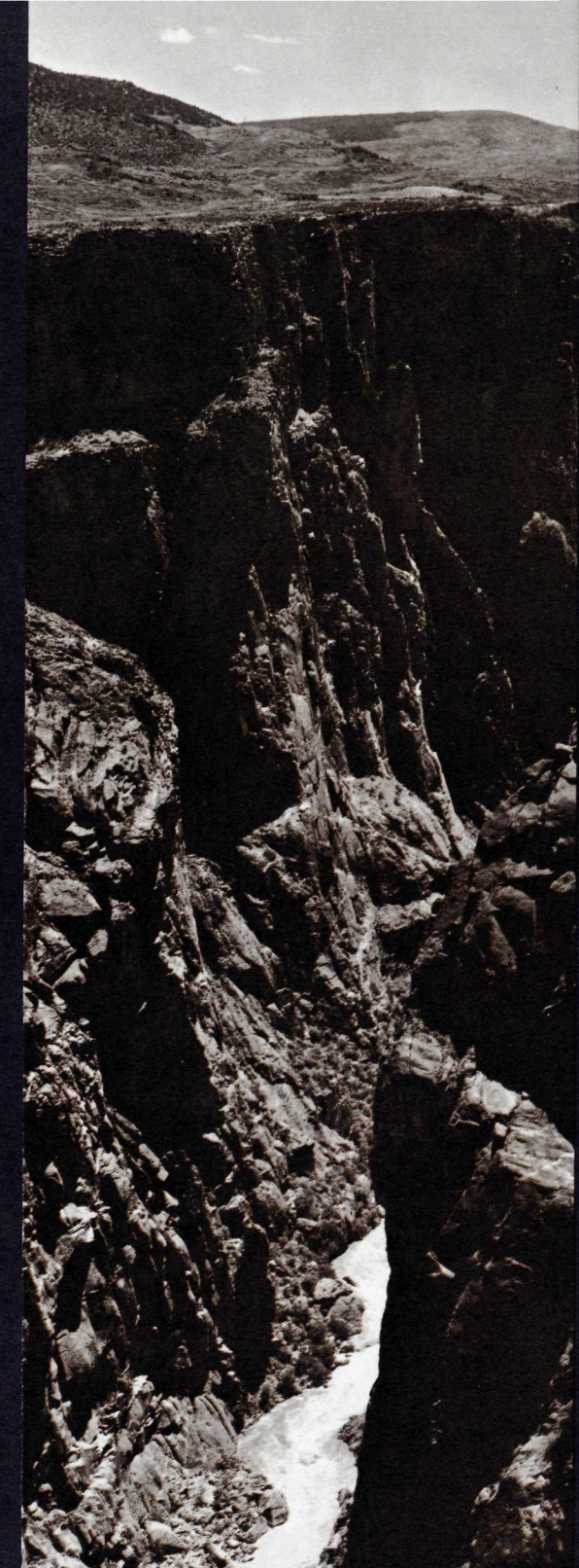
BLACK CANYON OF THE GUNNISON National Monument • Colorado

☆ U.S. GOVERNMENT PRINTING OFFICE: 1970-392-724/28 REPRINT 1969