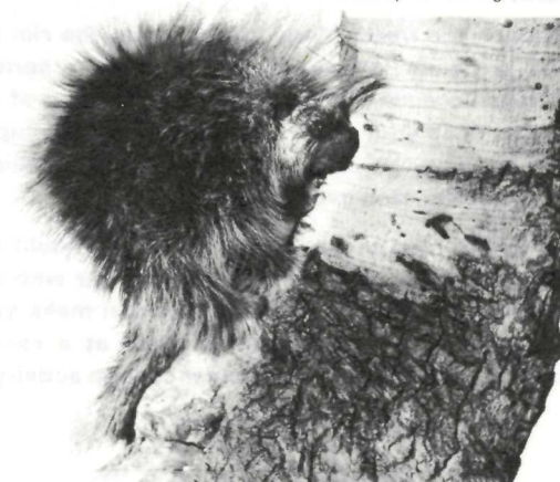
Porcupine feeding on bark.

The river had established its course on the soft volcanic rocks. As the area gradually rose, the river cut through these to the hard crystalline rocks of the present canyon. Its course committed, the stream had no alternative but to continue to cut through this once-buried hard core.