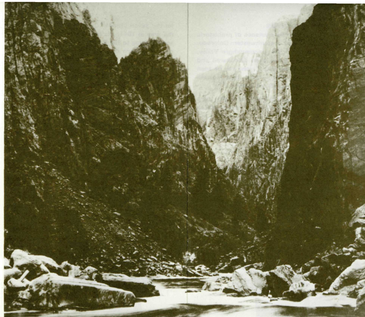
Looking up Black Canyon from Flat Rock.

The first impression you get upon viewing this great gash in the earth's surface is that some cataclysm in the remote geologic past occurred here. Actually, the canyon's landscape was formed by a slow, but continuous process of erosion—scouring by the turbid, seasonally flood-swollen river, the rush of mud-laden side streams after heavy rains, occasional rockfalls from high cliffs, and the relentless creep of landslides. It took these agents of erosion about 2 million years to carve the canyon, and the excavating process is still in action, but at a slower pace because the river is dammed above the park.