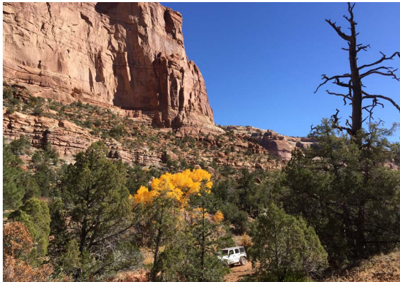
Travelers may be stuck for hours or even days after severe flood events. Always check the weather before heading in!

The OHV trail through the canyon is initially an old Jeep road. This rugged trail winds its way up the canyon, crossing the creek frequently. Four-wheel-drive and high clearance are required to drive this portion of the trail. The trail is often impassable due to flooding. The road ends at the Forest Service boundary at the confluence of Arch and Texas Canyons.