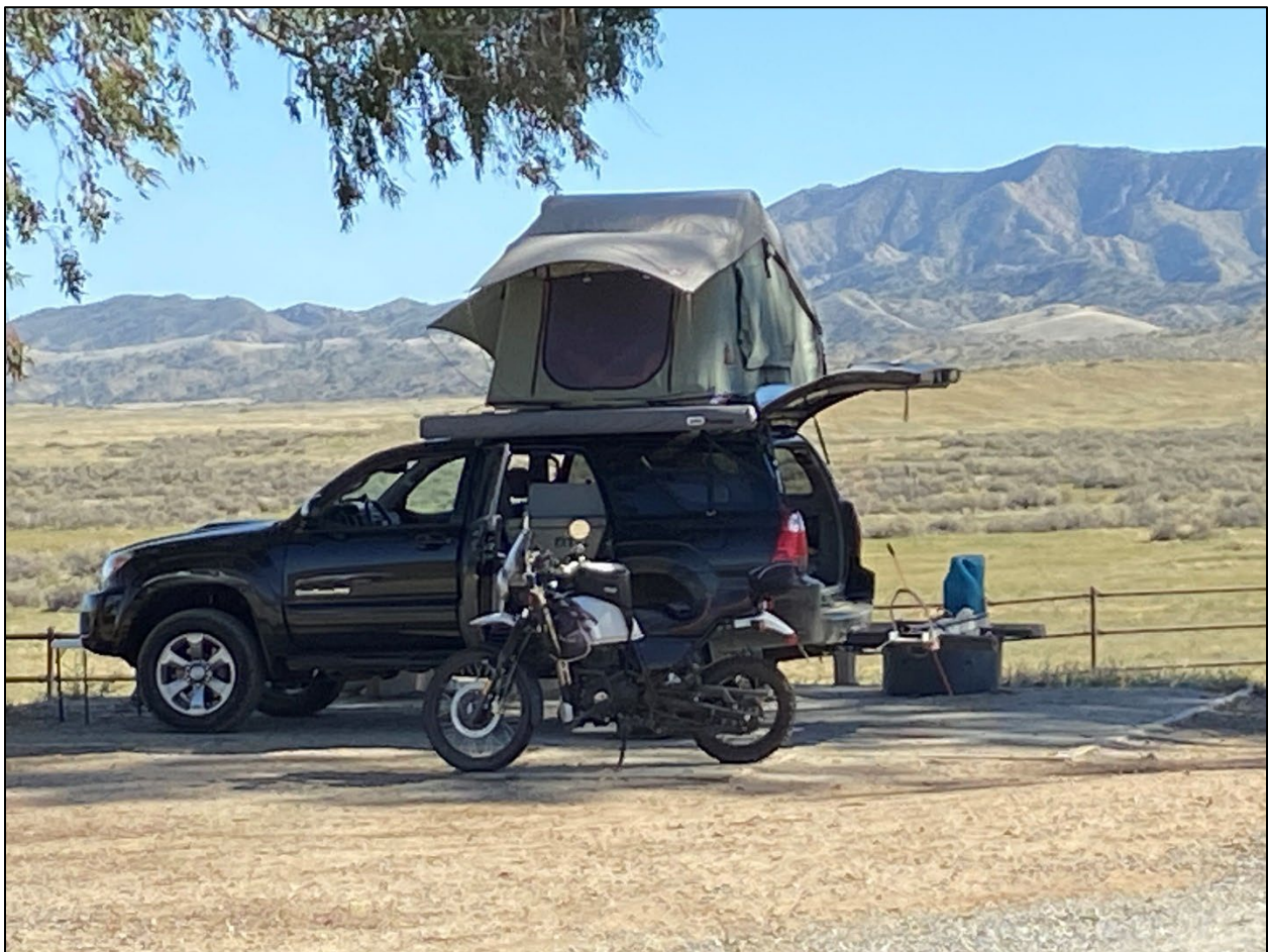
Visitors setting up camp at KCL campground.

The Monument received 66,849 visits this year; typical visitation for a non-wildflower year is 50,000 to 60,000 visitors. The higher visitation numbers could be attributed to the public looking for the kind of wide-open spaces the monument provides. Dispersed camping, hiking, wildlife and wildflower viewing, hunting and exploring continue to be the most popular recreational activities. Guided tours to some of our significant cultural sites are very popular and fill up every year. Self-guided tours to cultural sites are also available throughout most of the year.