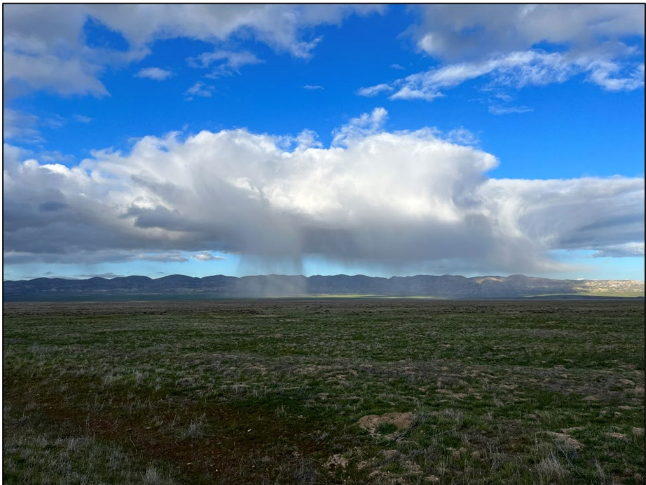
A view of Carrizo Plain with clouds and sky.

Monument staff continue to shift some of the water wells that were traditionally pumped by gas-powered generators to solar pumps. Staff have identified additional wells to transition to solar in the next few years.