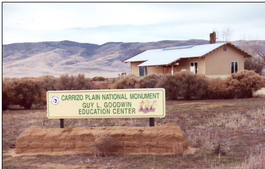
Photo of the Goodwin Education Center, circa 2007, prior to the 2022 expansion of 800 sq. ft.

Other accomplishments include hiring a new wildlife biologist and a park ranger to assist in patrolling and staffing the visitor center.