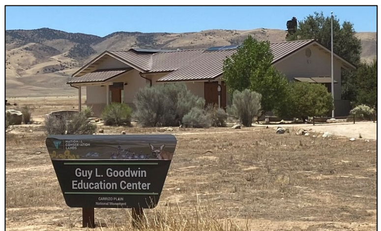
Photos of the Goodwin Education Center after the expansion to 1600 sq. ft.