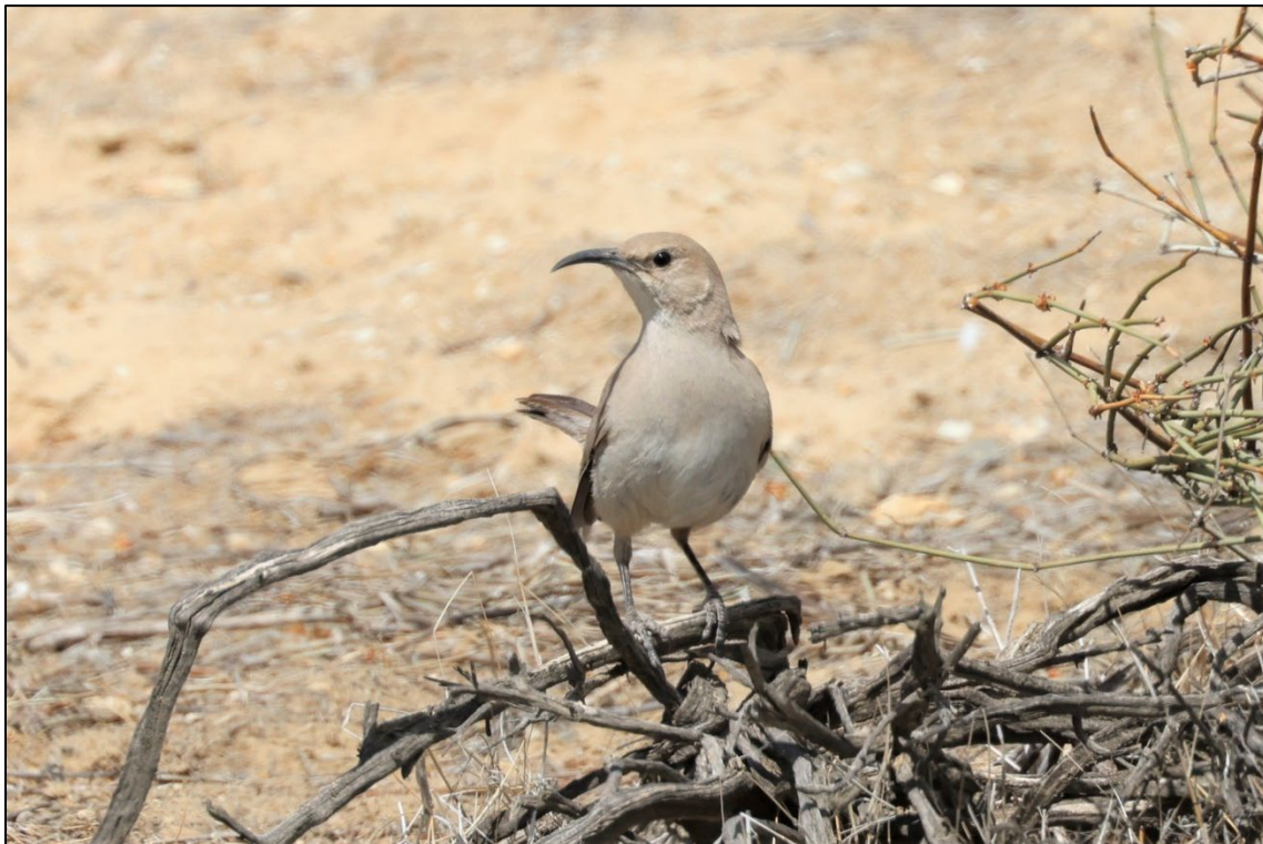
LeContes Thrasher in the brush.

New species to science are still being discovered in this unique landscape. The Soda Lake Scorpion ( Paruroctonus soda ), for example, was recently described in a 2022 publication. Also noted in 2022 were an undescribed species of jumping spider ( Terralonus sp.).