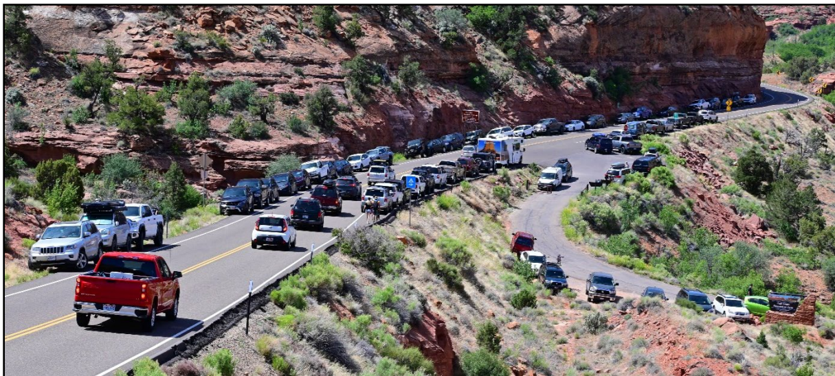
Figure 3. Vehicles parked on the shoulder of Highway 12 at the Calf Creek Recreation Area.

GSENM staff work hard protect to GSENM objects and sensitive resources through public education. Staff rehabilitated damaged areas, replaced signs, monitored sites, reported problems to management, and educated visitors in the field. Additional staff would help us better protect Monument objects and resources while continuing to provide world class recreational opportunities.