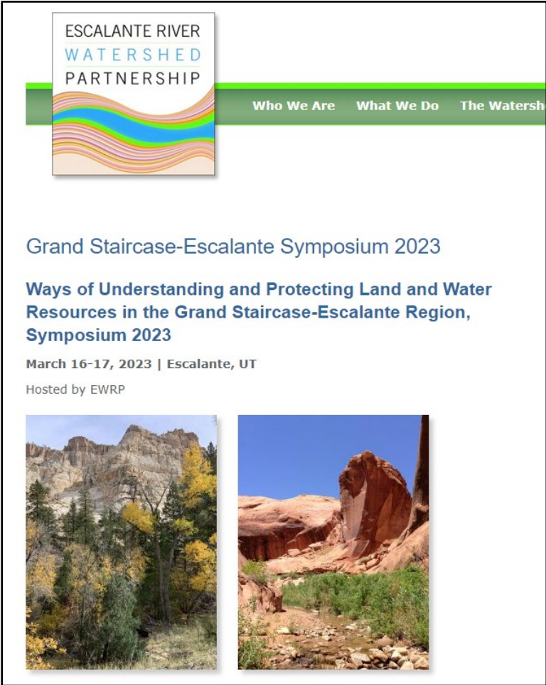
Figure 11. Announcement for the 2023 symposium on ways of understanding the Grand Staircase-Escalante region.

In March 2023, monument staff participated in the second annual Symposium on Ways of Understanding and Protecting Land and Water Resources in the Grand Staircase-Escalante Region. Over 100 people participated in Escalante or on Zoom, with talks on vegetation, water, Indigenous perspectives, wildlife, and history of the region.