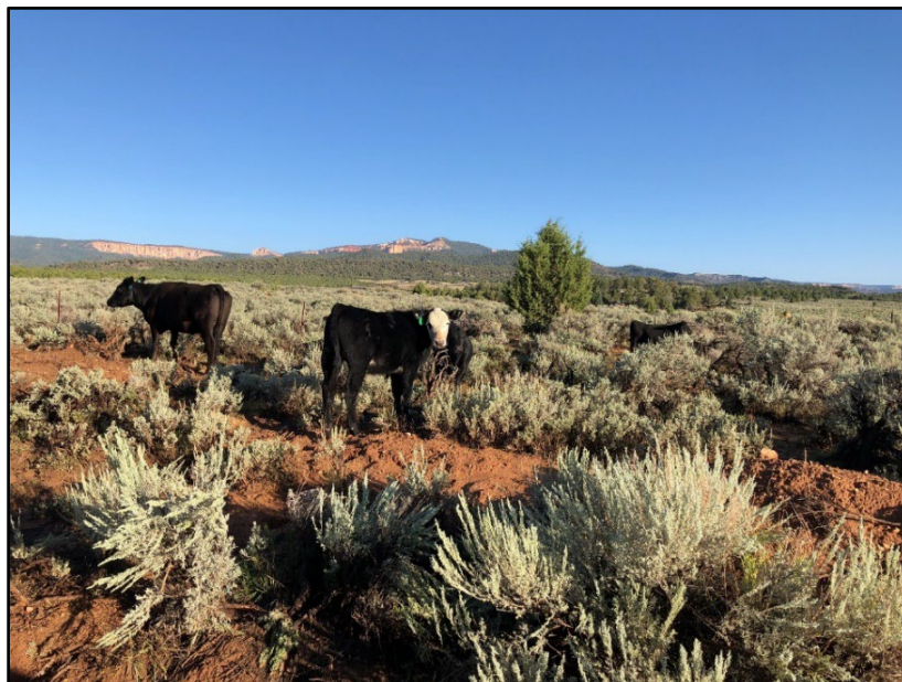
Figure 14. Cattle in the Skutumpah region of GSENM.

Rangeland management staff were able to collect monitoring data on 60 livestock grazing allotments, conduct 183 compliance inspections, process seven transfers, and issue 189 grazing bills. Work was also initiated on five water-related range improvement projects that, when completed, will aid in the distribution of grazing livestock and moderate utilization levels within those allotments.