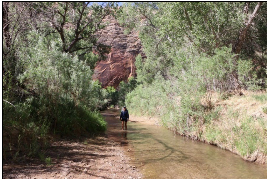
Figure 4: Backpacker hiking in Escalante River.

Many of the other 28 trailheads including Dry Fork Slot Canyons, and Willis Creek are also experiencing challenges due to high visitation levels as well.