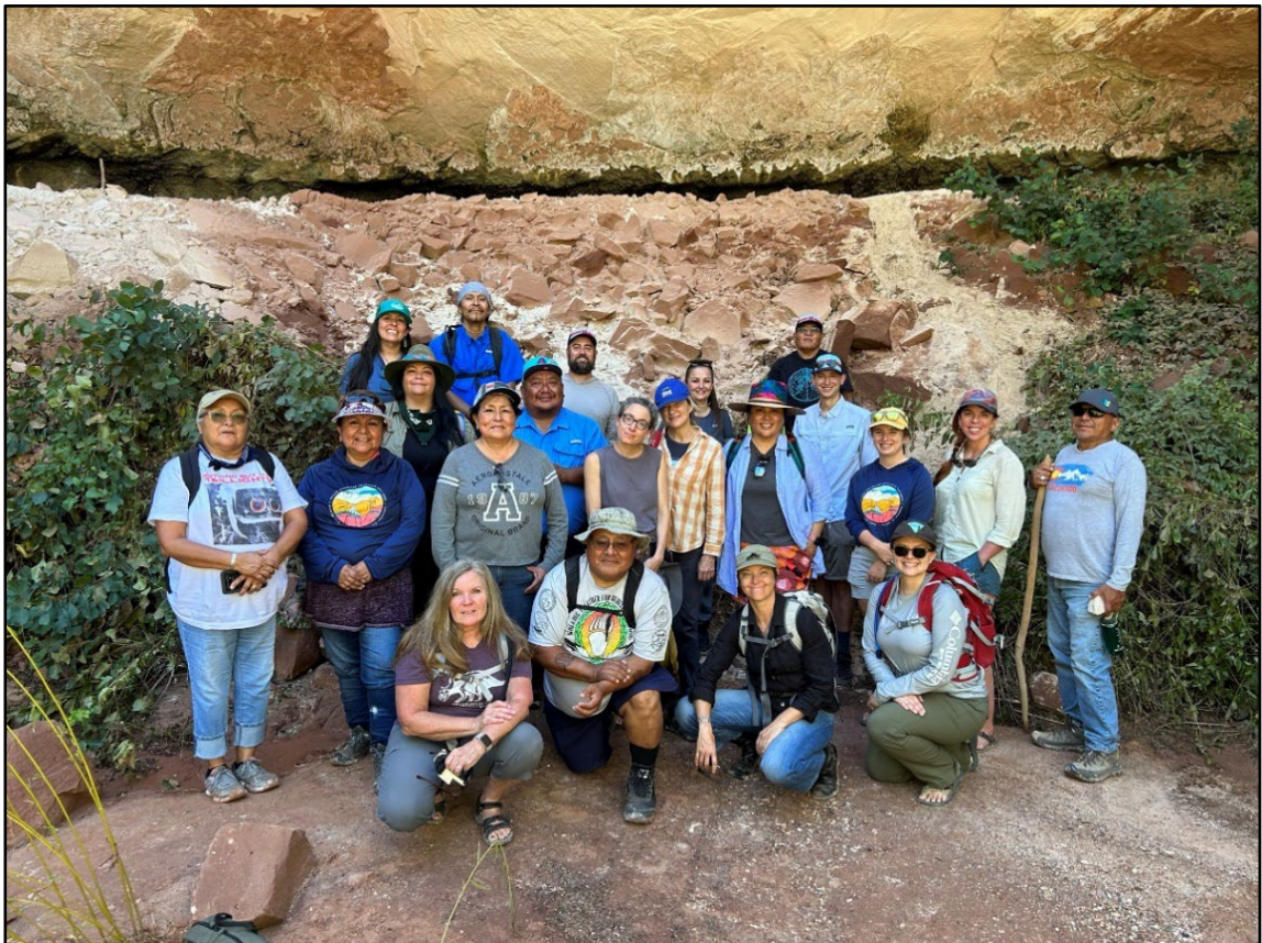
Figure 10. BLM staff, partners and Tribal representatives at White House Spring.

GSENM consulted or engaged with numerous federally recognized Tribes including Kaibab Band of Paiute, Paiute Indian Tribe of Utah (and constituent bands), San Juan Southern Paiute Tribe, Ute Indian Tribe of the Uintah and Ouray Reservation, Ute Mountain Ute, Navajo Nation, Hope Tribe, Zuni Tribe, Pueblo of Acoma, Pueblo of San Felipe, and Pueblo of Tesuque. In the Fall 2023, GSENM hosted an Intertribal event (photo below) to foster dialogue among many of those Tribes, GSENM leadership, and non-government organizations.