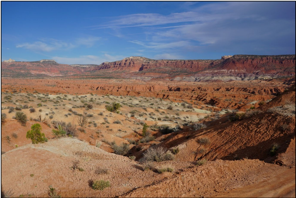
Figure 13. A portion of the Old Spanish Trail in the Paria River area of GSENM.

BLM completed the GSENM Old Spanish National Historical Trail Inventory, Assessment, and Monitoring Report in the Fall of 2023. The inventory report will be used to establish a National Trail Management Corridor through the BLM's land use planning process, to evaluate proposals for management consistency, and to aid impact analysis for National Environmental Policy Act compliance. The Old Spanish National Historic Trail was established by Congress in 2002 under Public Law 107-325 as part of the National Trails System. It is jointly administered by the National Park Service and BLM. National Historic Trails commemorate original trails or routes of travel of cultural significance including past routes of exploration, migration, and military action. The Old Spanish National Historic Trail identifies and protects a historic trade and travel route from the early 19 th century between Sante Fe, New Mexico and Los Angeles, California, including remnants and artifacts, for public appreciation and enjoyment.