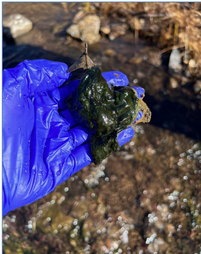
Figure 8. Cyanotoxins (harmful algal bloom) in Calf Creek.

Potential climate change impacts have been observed in several water systems throughout GSENM. Calf Creek has been an EPA 303(d) listed waterway since 2008 due to high water temperatures in a system that supports cold water aquatic life. Cyanotoxin Harmful Algal Blooms (CHAB) have also been detected and sampled throughout GSENM with some containing potentially harmful toxins. These CHABs are similar to what has been found in the nearby Zion National Park. GSENM biologists put on a CHAB identification training for staff and are part of a working group to help determine best data collection practices for CHABs.