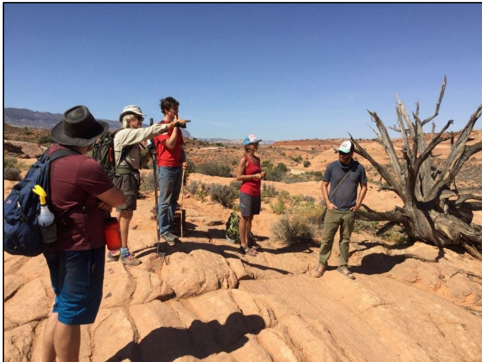
Figure 5. BLM staff and volunteers on a service project in Escalante Canyons area.

BLM staff participated in the Escalante River Watershed Partnership to do research, remove invasive Russian olive trees, and perform other restoration efforts.