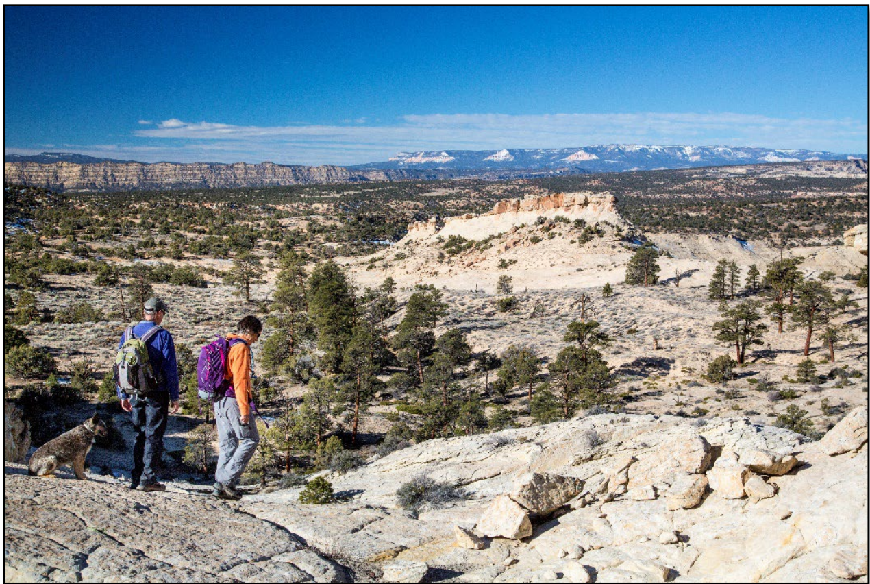
Figure 2. Hikers in the Escalante Canyons region of GSENM.

In 2023 the team at Grand Staircase-Escalante National Monument (GSENM) continued work on the Resource Management Plan (RMP) and Environmental Impact Statement (EIS) as directed by Presidential Proclamation 10286. The Draft RMP/EIS was published in August of 2023, as part of this multi-year planning effort that will carry into Fiscal Year (FY) 24. The publication of the Draft RMP/EIS initiated a 90-day public comment period and included six public engagement meetings, four of which were held in Kanab, Escalante, Panguitch and Salt Lake City along with two virtual meetings. This important work will guide land management at GSENM for years to come.