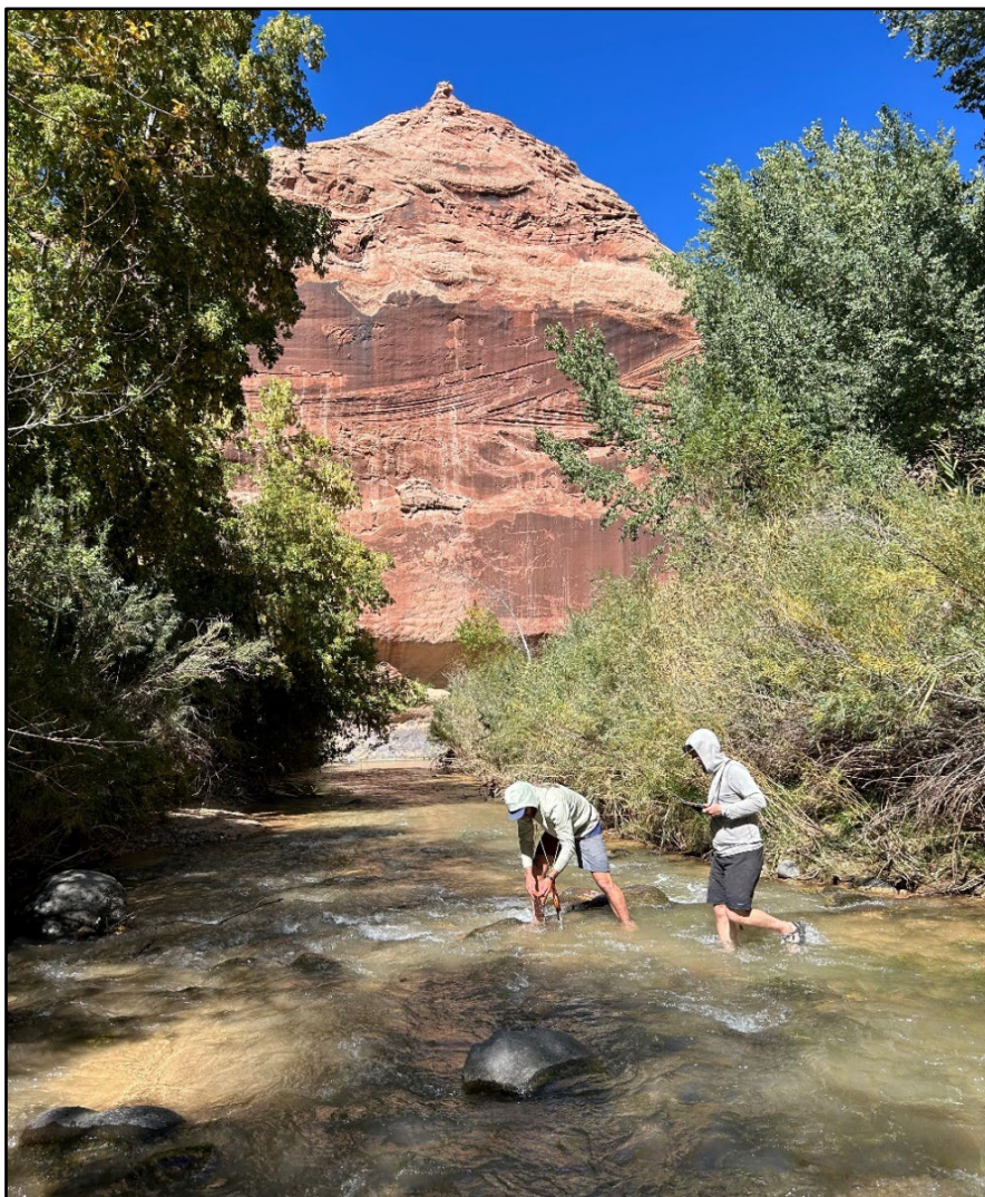
Figure 9. BLM AIM Lotic crew collecting data in the Escalante River.

The AIM data collection is helping monument staff understand changes in vegetation, hydrology, and other environmental conditions. This information is being used to track impacts on terrestrial and aquatic resources. The data, coupled with climate analysis and management direction, can help GSENM alleviate climate impacts to monument resources.