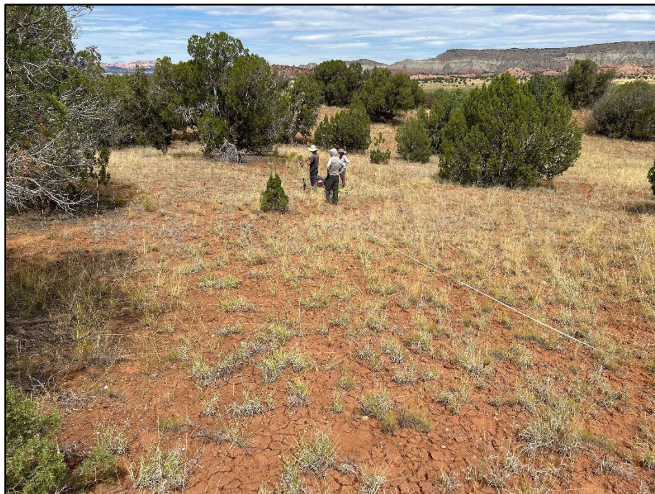
Figure 7. BLM AIM Terrestrial crew collecting data in Kodachrome region of GSENM.

The BLM Assessment Inventory and Monitoring (AIM) program continued to conduct detailed surveys at uplands (Terrestrial), streams (Lotic), and riparian and wetland sites across GSENM. In 2023, the AIM program surveyed some of the 122 Terrestrial and 42 Lotic sites that have been established in GSENM. The new riparian and wetland AIM protocol was conducted at four sites in 2023, and more sites will be added in coming years. The AIM data have been utilized extensively in the RMP process.