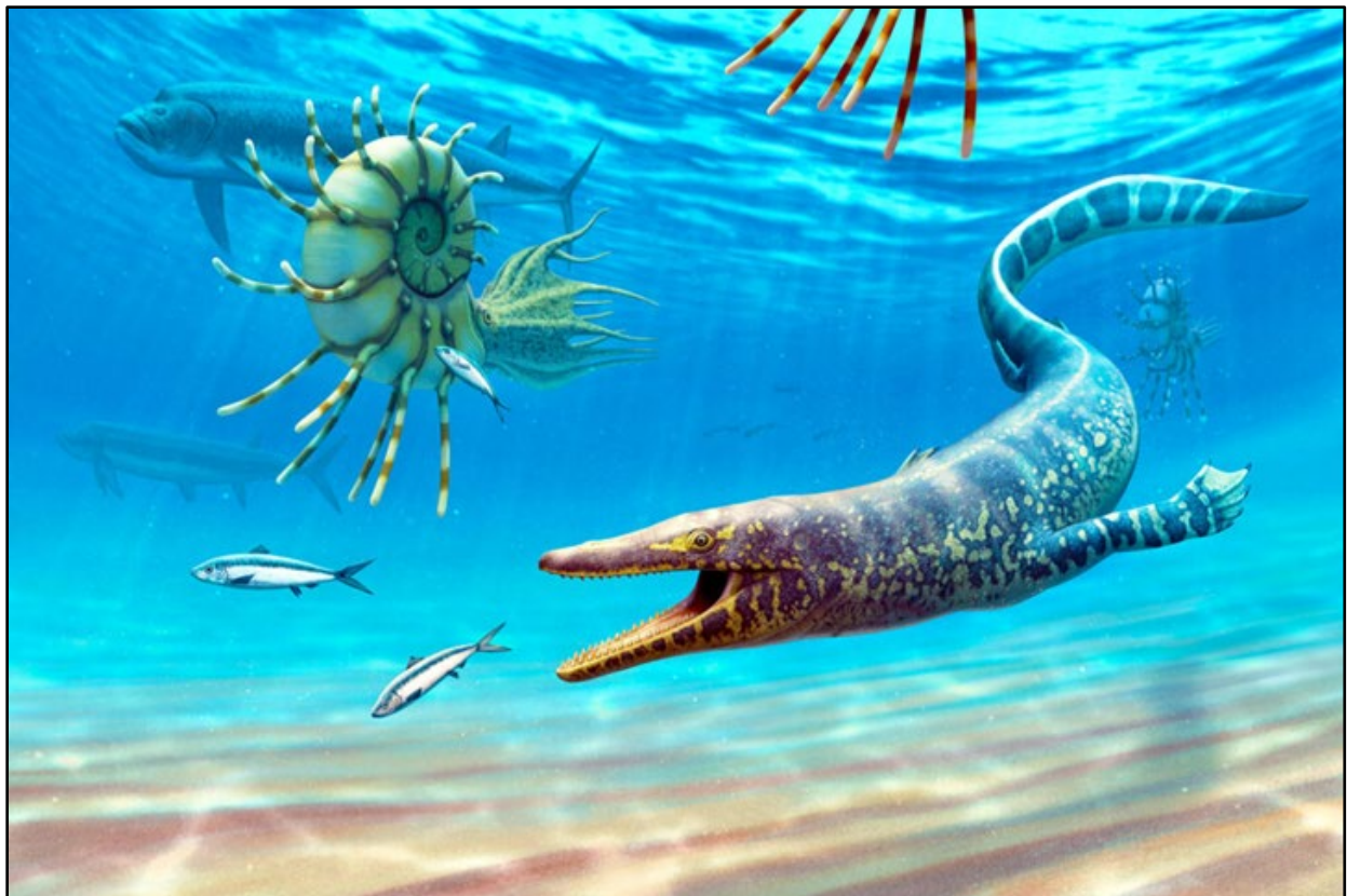
Figure 6. Reconstruction of the early mosasaurid Sarabosaurus dahli published by the GSENM paleo team in 2023. Art courtesy of Andrey Atuchin.

Additionally, the Colorado Plateau Archaeological Association and GSENM completed limited test excavations in Johnson Canyon to answer questions regarding the nature and distribution of early dry-farming Basketmaker II agricultural sites in the region. The project also enabled BLM to gather and evaluate baseline archaeological data critical for monument management purposes.