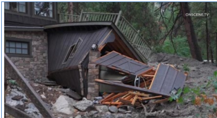
Massive debris flows on Sep. 12 damaged dozens of homes and businesses, like this home (above) in Forest Falls. Birch Creek in Oak Glen exceeded its banks and spread thick debris and boulders (below) across a long stretch of Potato Canyon Road.

The winter of 2021-2022 was relatively dry, leaving little snowpack and below normal precipitation. The dry trend was expected to continue through fall. What was not expected was an unusually lengthy monsoonal summer/fall that brought heavy precipitation to the mountains and rarer rain to coastal areas through late July and September. The summer storms brought heavy rains to the San Bernardino Mountains, at times, 1 inch per hour. Unfortunately, some of the monsoonal storms hit directly over the El Dorado Fire burn scar, resulting in heavy debris flows prompting evacuations in communities at lower elevations such as Forest Falls and Angeles Oaks, and closures of partner lands within the Monument boundary.