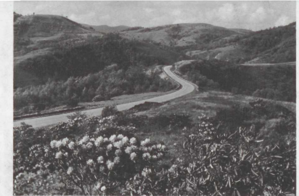
RHODODENDRON AT ALLIGATOR BACK, MILE 242.6 Entering North Carolina, you will find the mountain country higher and more sparsely settled. Rolling bluegrass pastures terminate in precipitous bluffs. Rhododendron blooms through Doughton Park in early June.