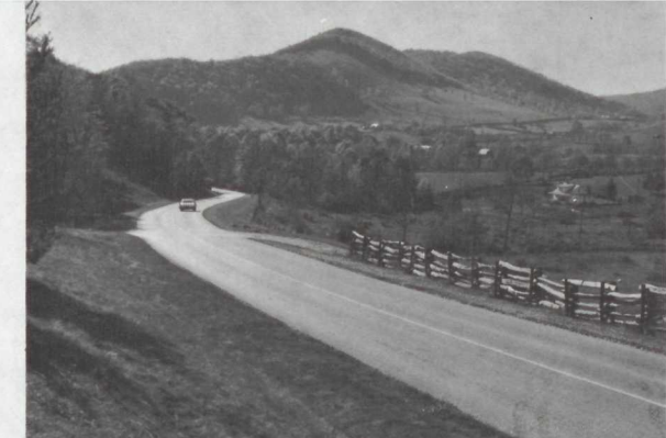
PARKWAY NEAR ROCKY KNOB, MILE 167 For 150 miles south of Roanoke, Va., the Blue Ridge is a high rolling plateau which breaks sharply on the east.