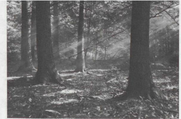
THE FOREST, LINVILLE FALLS, MILE 316.3 The parkway skirts the mountain resort area of North Carolina and skips in and out of Pisgah National Forest from Grandfather Mountain (el. 5,939) to Great Smoky Mountains.