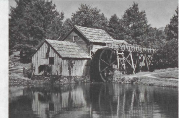
MABRY MILL, MILE 176.1 Blue Ridge Parkway passes through a region rich in the folk history of the late 1700's, when the Blue Ridge marked the edge of the western frontier. Log cabins, farm buildings, a church, and a gristmill are some of the structures preserved as evidences of the pioneer past.