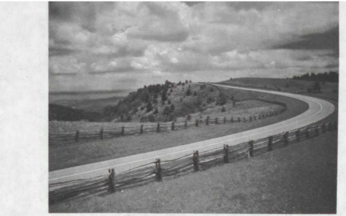
HIGHLAND MEADOWS, DOUGHTON PARK

Drinking water and comfort stations are provided, but no shower or laundry facilities are available. Sites in each campground are designated for trailer use, but none is equipped for utility connections. Sanitary dumping stations for trailers are provided at