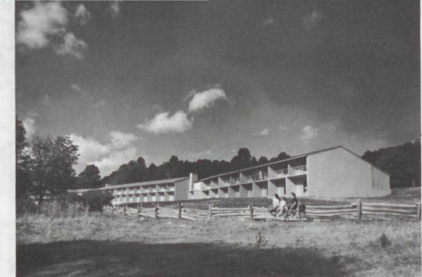
PEAKS OF OTTER LODGE, MILE 85.6 After crossing the James River, the parkway ascends 3,286 feet in 13 miles to its highest elevation in Virginia, 3,950 feet.