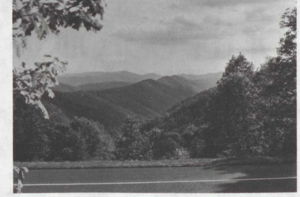
WHETSTONE RIDGE FROM PARKWAY, MILE 28 The parkway winds in and out of George Washington National Forest from Mile 0 to James River. South of the river to Roanoke, it is in Jefferson National Forest. It crosses Otter Creek nine times between Mile 56.6 and James River, and at Mile 63.2 drops to its lowest elevation, 649.4 feet.