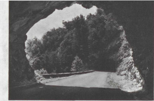
TWIN TUNNELS, MILE 344.5 The mountains reach their greatest height at Mount Mitchell in the Black Mountains. The once magnificent dark green forest of Fraser fir is dying, victim of the woolly aphid. The trees give the Blacks their name.