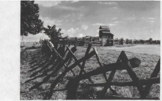
THE FENCES, GROUNDHOG MOUNTAIN, MILE 188.8

Visitor-use areas are marked by this emblem. In them may be located picnic areas and campgrounds, visitor centers, exhibits, trails, food, gas, lodging, and comfort stations. See map narrative for facilities in a particular place.