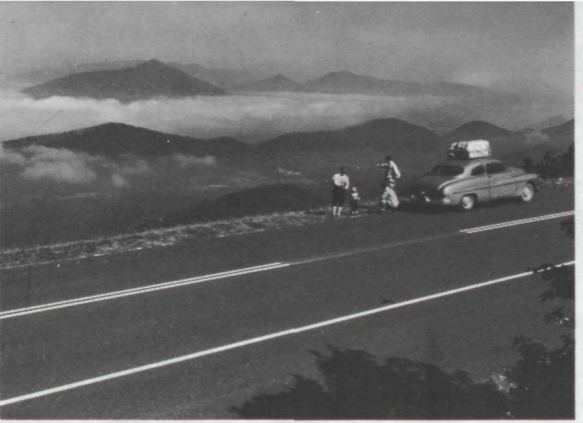
PURGATORY MOUNTAIN, MILE 92.2

Blue Ridge Parkway "tells" the story of these fiercely independent people, a story still being