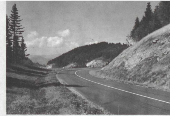
PARKWAY ON RICHLAND BALSAM, MILE 431.4 The parkway skirts pyramidal Mount Pisgah (el. 5,721) and soars a mile high across the Balsams and Plott Balsams. Range upon range, the mountains stretch to the horizon.