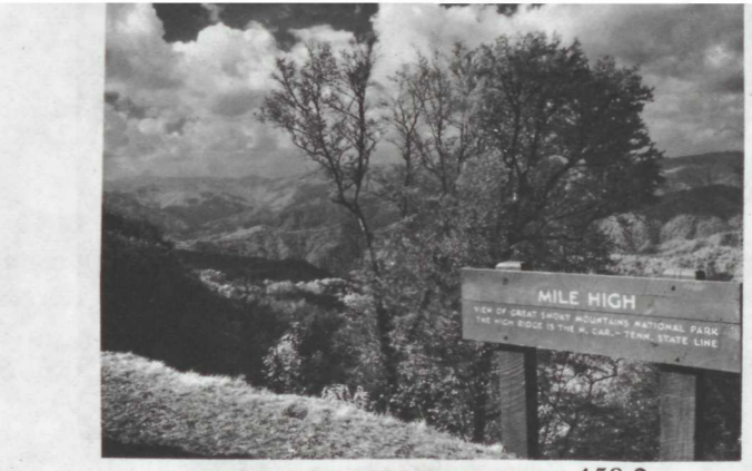
MILE HIGH OVERLOOK, MILE 458.2

The Appalachian Trail roughly parallels the parkway from Mile 0 at Rockfish Gap to Mile 103, where the trail takes a more westerly route toward the Great Smoky Mountains and Georgia. Shelters, 1 day's hike apart, are available on a first-come, first-served basis all along the Appalachian Trail. Information about the trail may be obtained from the Appalachian Trail Conference, 1718 N Street NW, Washington, D.C. 20036.