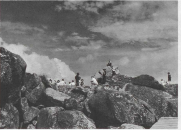
SUMMIT OF SHARP TOP, PEAKS OF OTTER

Campgrounds, picnic areas, and other visitor accommodations are open May 1 through October. Guided and self-guiding walks, evening nature