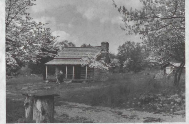
THE MOUNTAIN FARM CABIN, MILE 5.8 At the northern end of Blue Ridge Parkway is Shenandoah National Park, 75 miles long and from 2 to 13 miles wide. Its most celebrated features are mountain slopes of lush beauty and a succession of panoramas from Skyline Drive, which is 105 miles long and connects with the parkway at Rockfish Gap.