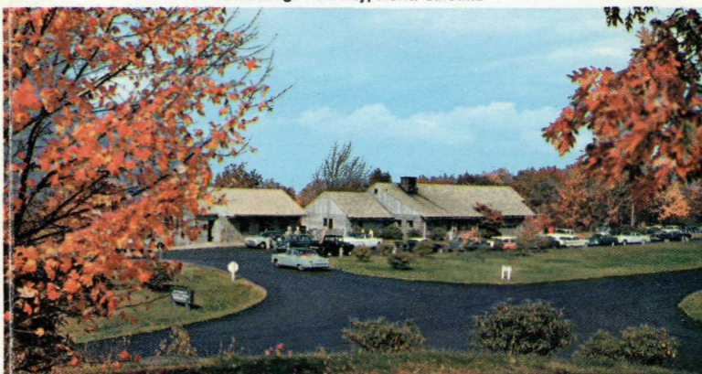
BLUFFS COFFEE SHOP AND SERVICE STATION Doughton Park — Blue Ridge Parkway, North Carolina