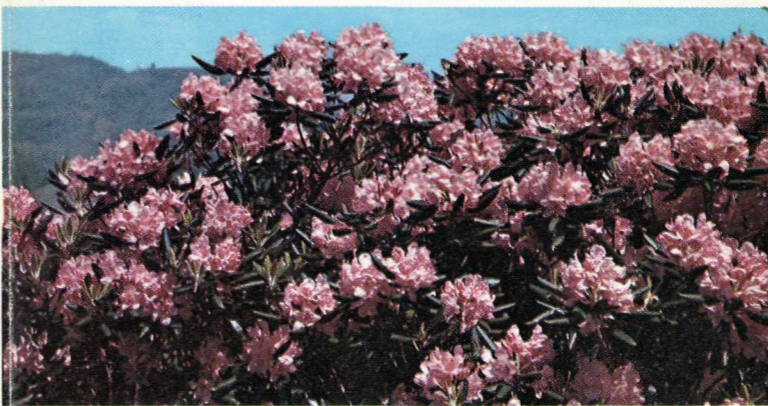
RHODODENDRON—CRAGGY GARDENS Blue Ridge Parkway, North Carolina