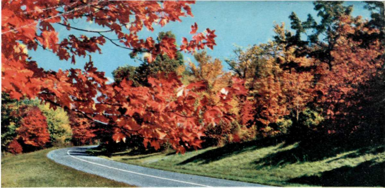
AUTUMN COLOR ALONG PARKWAY Virginia-North Carolina