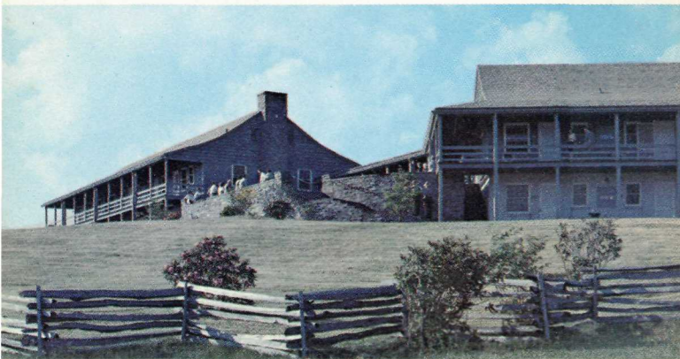
BLUFFS LODGE — DOUGHTON PARK Blue Ridge Parkway, North Carolina