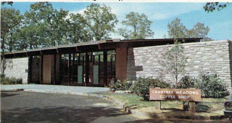
CRABTREE MEADOWS COFFEE SHOP Blue Ridge Parkway, North Carolina