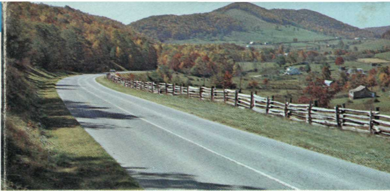
PASTORAL SCENE ON THE PARKWAY Blue Ridge Parkway

BLACK MOUNTAINS FROM BUCK CREEK GAP → Blue Ridge Parkway, North Carolina