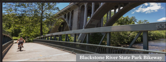
Blackstone River State Park Bikeway