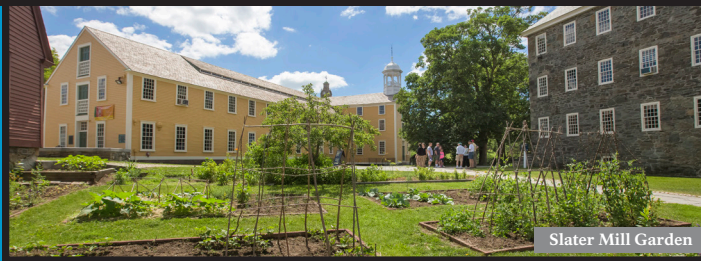
Slater Mill Garden