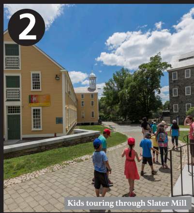
Kids touring through Slater Mill