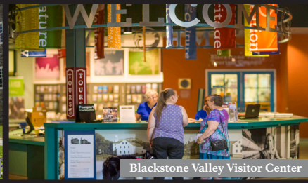
Blackstone Valley Visitor Center