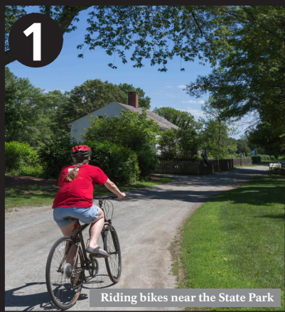
Riding bikes near the State Park