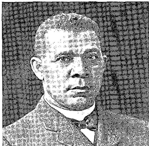
Booker T. Washington

original Burroughs plantation. Located here is a replica of the slave cabin similar to the one in which Booker was born. The spring from which Booker drew water continues to flow, and the catalpa and juniper trees that were growing when he was a boy still stand today.