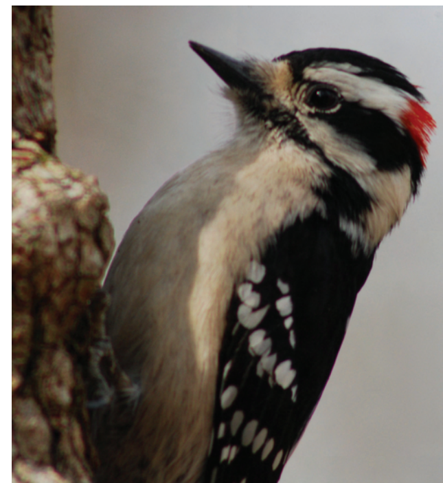
Downy Woodpecker