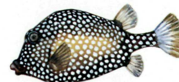
Smooth trunkfish ( Lactophrys trigonus )