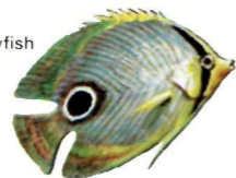
Foureye Butterflyfish ( Chaetodon capistratus )

When whites first set eye on Buck Island in the 1700s, it was covered with Lignumvitae trees, locally called Pokholdt trees. The island took its name from these trees. Corrupted by usage, the name changed from "Pocken-Eyland" (Dutch) to "Bocken" and finally to "Buck." The latter two names refer to goats which were pastured on the island beginning in the 1750s. Sometime during the 19th century, the Lignumvitae trees were cut for lumber—incidentally creating abundant pasture for the island's goats. When rapid regrowth of the forest threatened the goats in the early 1900s, the eastern half of the island was burned over repeatedly.