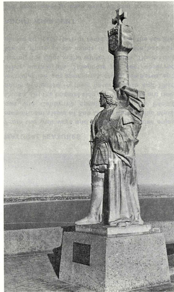
CABRILLO STATUE, CARVED BY ALVARO DdBREE OF PORTUGAL

Cabrillo's voyage, while representing but an incident in the many land and sea explorations by which Spain gained a foothold in the New World, provided the Spanish with a new knowledge of the Pacific coast, its climate, and its people. It uncovered no cities of gold or great civilizations, but it did serve as an incentive to the Spanish to continue their investigation of the Pacific coast and helped to open the way for others, in centuries to come, to settle the land, to build cities from the ocean's edge to the mountains, and to fulfill the promise of the new discovery.