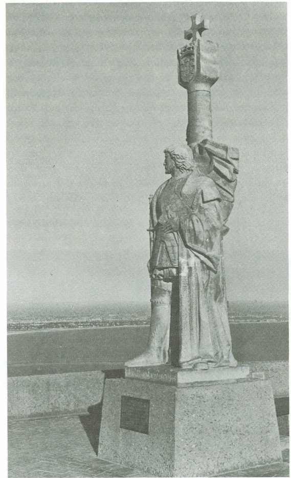
CABRILLO STATUE, CARVED BY ALVARO DeBREE OF PORTUGAL

Cabrillo's voyage, while representing but an incident in the many land and sea explorations by which Spain gained a foothold in the New World, provided the Spanish with a new knowledge of the Pacific coast, its climate, and its people. It uncovered no cities of gold or great civilizations, but it did serve as an incentive to the Spanish to continue their investigation of the Pacific coast and helped to open the way for others, in centuries to come, to settle the land, to build cities from the ocean's edge to the mountains, and to fulfill the promise of the new discovery.