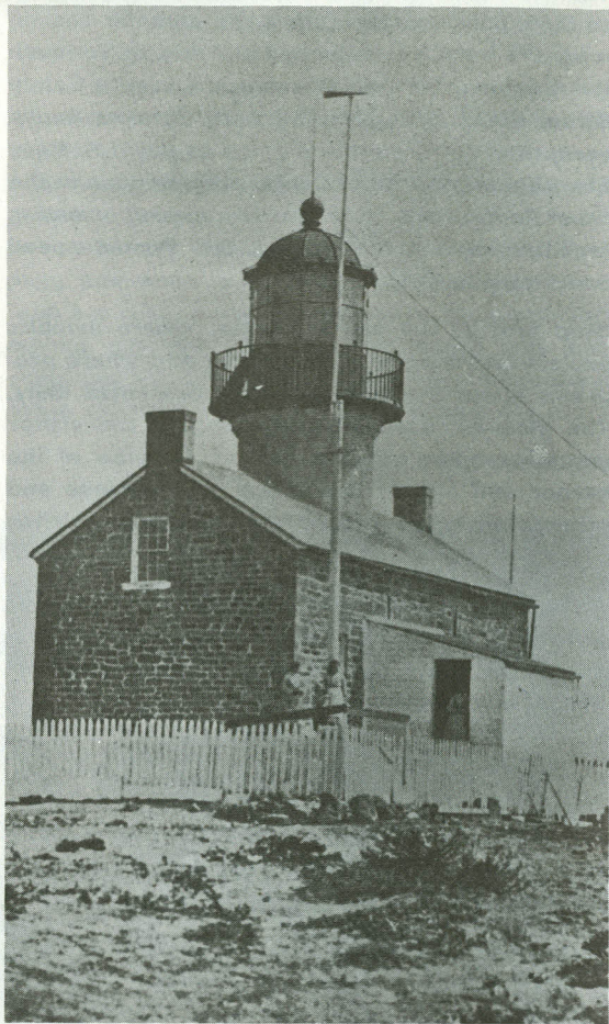
OLD LIGHTHOUSE IN 1860'S