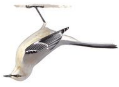
Mockingbird ( Mimus polyglottos )

Short conical bill, medium stocky body, rounded wings, long tail, mostly gray with white patches on wing and tail, seen alone in defending trees eating insects and fruit.