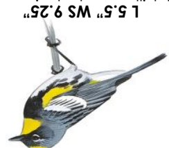
Yellow-rumped Warbler ( D. coronate )

Stout dark bill, rounded wing, oval body, short tail, gray-brown with bright yellow-spot on rump usually seen when flying away, see in small perched flocks, quick flight