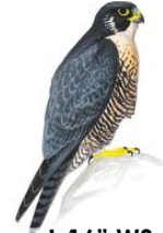
Peregrine Falcon ( Falco pergrinus )

Short hooked bill, stocky broad body, very pointed wings, shortish tail, sharp talons, dark "mustache", yellow eye and nose stripe, eats small and medium birds.