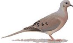
Mourning Dove ( Senaida macroura )

Short bill, small head, slender body, narrow pointed wings, long pointed tail, brown-gray with spots on wings, seen resting on wires or foraging on ground for seeds. Call is a sad hoot boo-hoo-hoo.