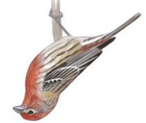
House Finch ( Carpodacus mexicanus )

Short stubby arched bill, round head, short tipped wings, longish square tail, brownish-forehead and chest, seen in small flocks. gray with streaks, M: has orange-red