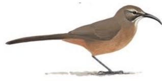
California Thrasher ( Toxostoma redivivum )

Long curved bill, slightly rounded body, rounded wings, long tail, buff color belly and undertail, dark eye-line, seen foraging (thrashing) on ground for inverts.