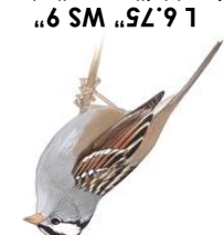
White-crowned Sparrow ( Z. albicollis )

Short conical bill, small stocky body, rounded wings, long tail, brownish-gray with light chest, orange-yellow bill, black-brown crown stripes with white center and eyebrows, winter group forager.