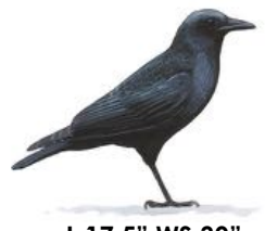
Crow ( Corvus brachyrhynchos )

Large straight bill, broad wings, short slightly rounded tail, black, seen flapping wings, extremely diverse diet, clear caw call