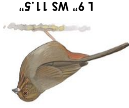
California Towhee ( Pipilo crissalis )

Short conical bill, medium stocky body, rounded wings, dark brown-gray color, cinnamon under tail, seen alone in the open and brush feeding on seeds, fruit, and insects.