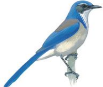
Western Scrub-Jay ( Aphelocoma insularis )

Thick billed, crestless head, sturdy body, broad round wings, long tail, dark to light gray underside, seen flying tree to tree, feeds on seeds, nuts, fruits, and insects.