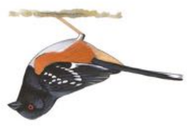
Spotted Towhee ( Pipilo maculatus )

Short blunt tipped bill, small stocky body, short rounded wings, short tail, mostly blue with orange breast, seen in small groups searching for seeds and insects.