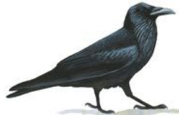
Common Raven ( Corvus corax )

Long slightly hooked bill, shaggy throat, long narrow wings, wedge-shaped tail, black, seen soaring, diverse diet, raspy voice.