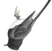
Black Phoebe ( Sayornis nigricans )

Short broad flattened bill, slight crest on head, rounded wings, long tail, blackish except for white belly, seen flying from low perch catching flying insects.