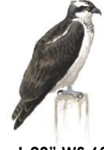
Osprey ( Pandion haliaetus )

Short hooked bill, stocky body, long crooked wings, striped tail, sharp talons, dark eye stripe and white hood, seen perched on poles, dives into water for fish