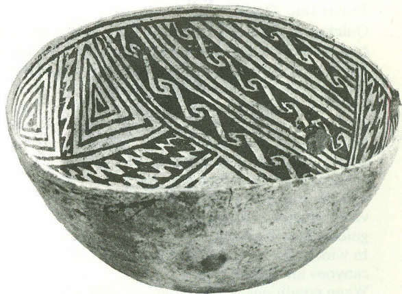
Decorated general-purpose pottery bowl