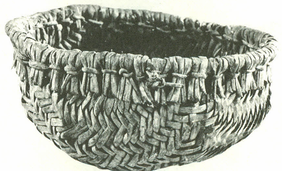
Ring basket of split yucca leaves. A type in common use from at least A.D. 1100 to the present.

In later centuries, the Basketmakers adopted many new ideas which were introduced into this area, such as the making of pottery, the bow and arrow, and bean cultivation. The style of their houses gradually changed through the years until finally they were no longer living in pithouses but were building rectangular houses of stone masonry above the ground which were connected together in compact villages. These changes basically altered Basketmaker life; and, because of the new "apartment house" style of their homes, the canyon dwellers after 700 are called Pueblos. Pueblo is the Spanish word for village, and it refers to the compact village life of these later people. Most of the large cliff houses in these canyons were built between 1100 and 1300, in the Pueblo period.