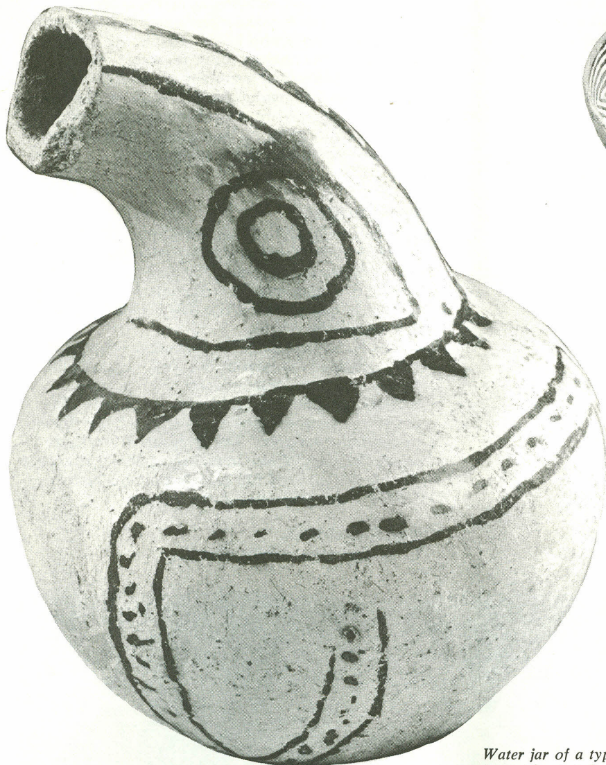
Water jar of a type used from about A.D. 900 to 1150.