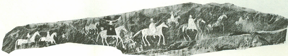
Part of the colorful Navajo painting at Standing Cow Ruin