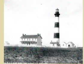
Bodie Island Lighthouse history