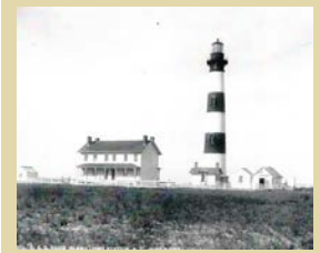
Bodie Island Lighthouse history