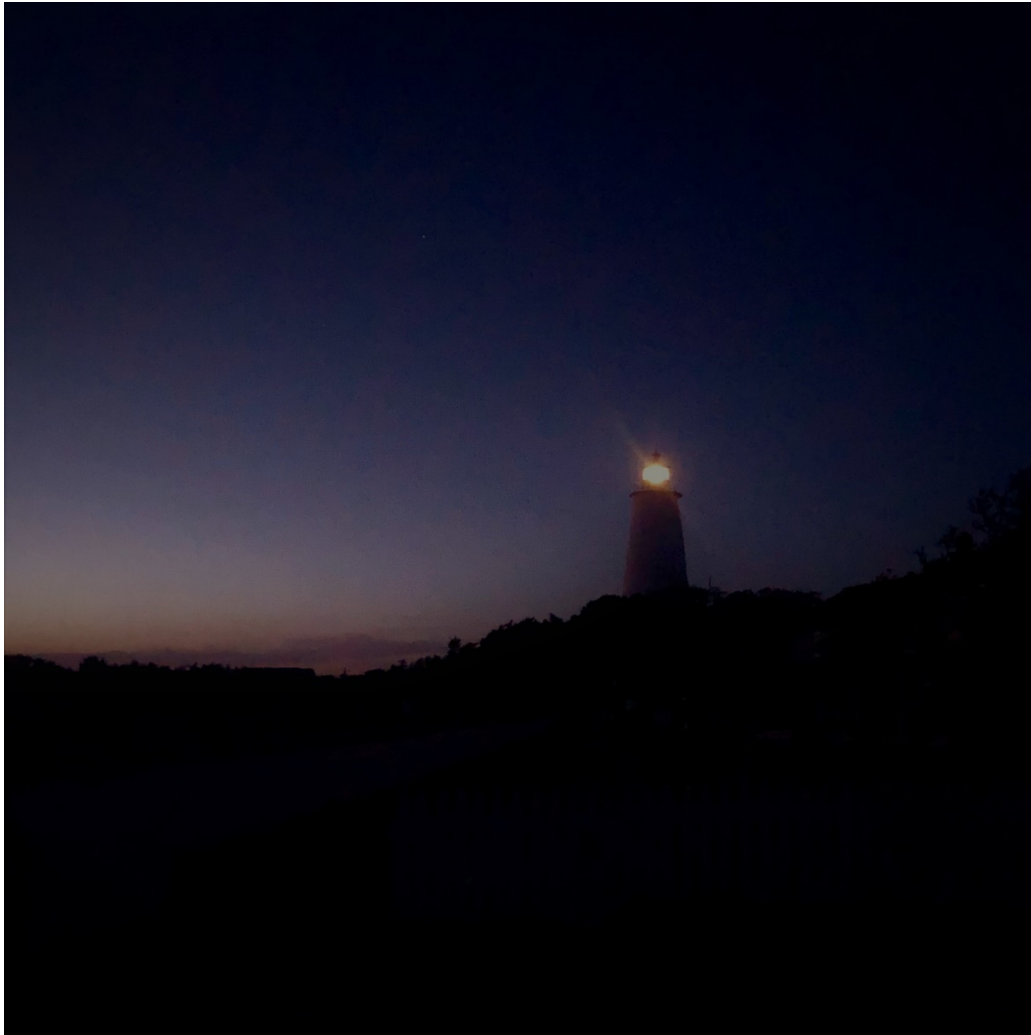
The Ocracoke Light was relit the evening of September 23. Thank you to the U.S. Coast Guard for fixing a mechanical issue inside the lighthouse.