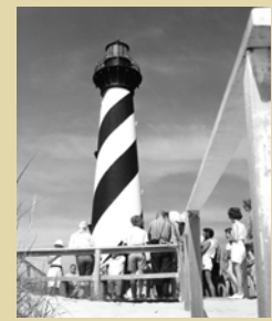
Cape Hatteras Lighthouse history