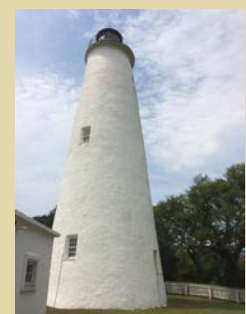
Ocracoke Lighthouse History