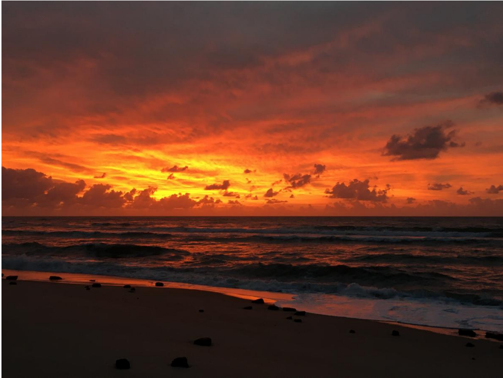
Incredible sunrise at Cape Point on October 21st.