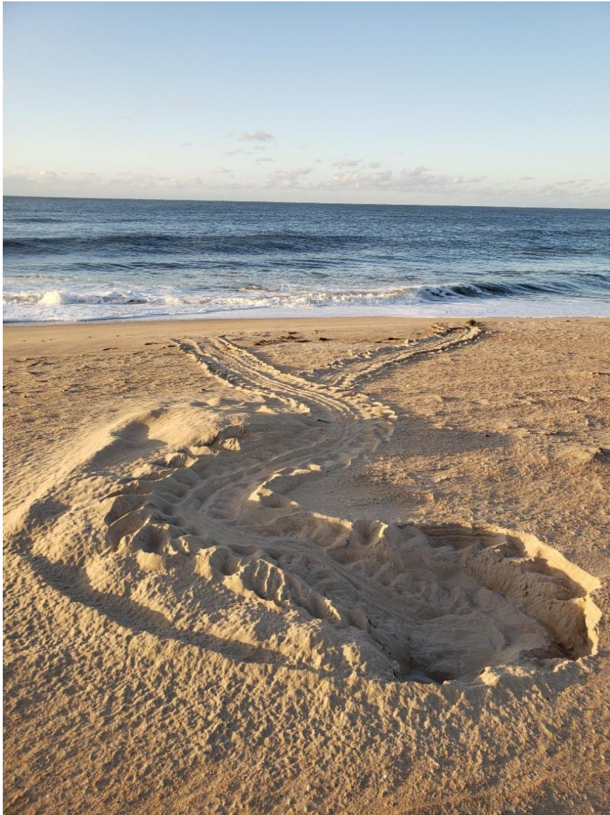
Photo of the late season green sea turtle nest found near South Beach Road.

Read more about the U.S. Weather Bureau Station located in Hatteras, NC.