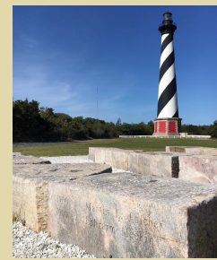
Cape Hatteras Lighthouse history