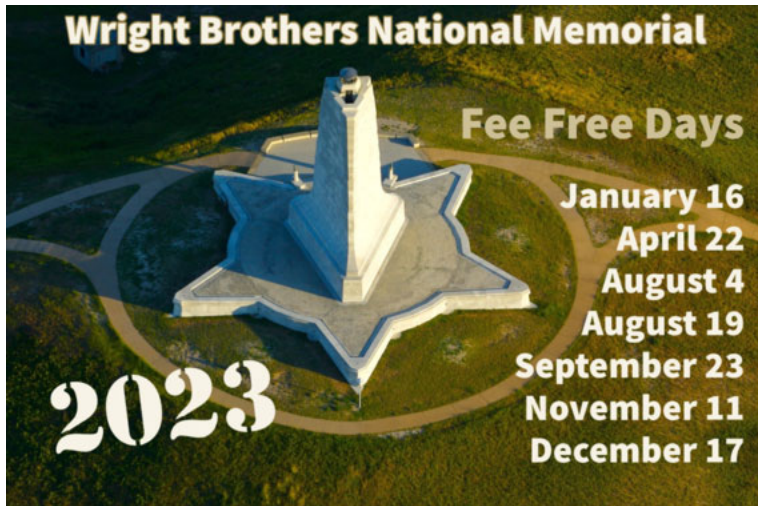
The first fee free day of the year at Wright Brothers National Memorial is next Monday, Jan. 16.