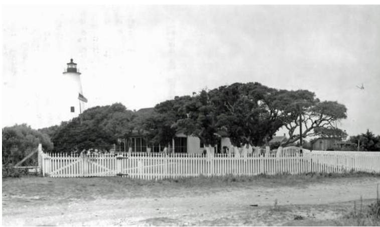
The National Park Service will celebrate later this year the 200th anniversary of the Ocracoke Light station. Photo taken on May 29, 1941.