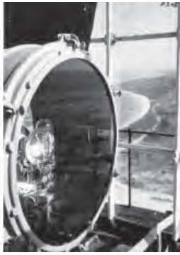
Modern electric beacon