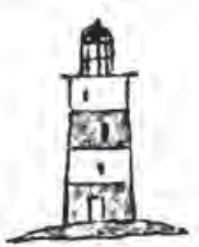
Sketch of the first Cape Lookout lighthouse

Built in 1812, the first lighthouse was only 107 feet in height. It was constructed as a wooden building with an interior brick stairwell and an iron lantern. Both the tower and the lantern were octagonal in shape. The wooden exterior of the tower was painted in red and white bands.