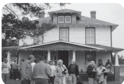
Theodore and Annie Salter House Visitor Center

Six buildings are open in the spring, summer, and fall. These buildings are the Visitor Center, Church, School, Post Office, Life-Saving Station, and Henry Piggot House. The other houses and buildings are closed.