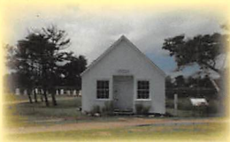
Post Office and General Store

The village can be reached from Ocracoke. Take a NC State Highway vehicle ferry from Hatteras Island, Swan Quarter, or Cedar Island. (Be sure to make reservations during the busy season by calling 1-800-BYFERRY.) Then, the knowledgeable Rudy Austin of Portsmouth Island Boat Tours (Reservations: 252-928-4361) will transport you to historic Portsmouth Village.