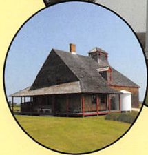
U.S. Lifesaving Station 1894