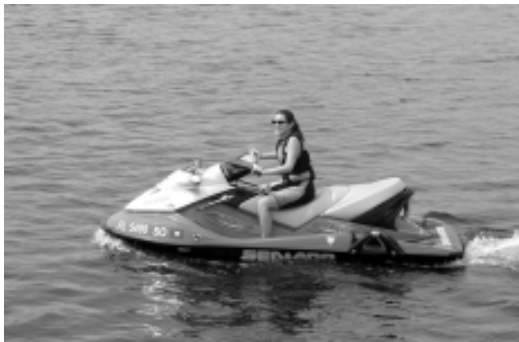
This PWC is operating at flat -wake speed