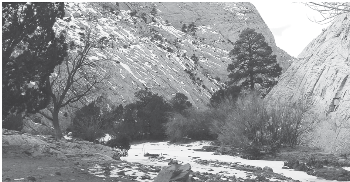
Oak Creek Canyon in the winter.

Capitol Reef species lists are available at the visitor center information desk and online ( www.nps.gov/care ). Utah sensitive species lists are available from the Utah Division of Wildlife and State Natural Heritage Program. Statistics for this bulletin are drawn from IRMA.nps.gov, the NPS's Northern Colorado Plateau Network, and the Western Regional Climate Center.