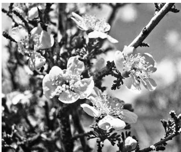
Cliffrose blooming in the desert.

Much of Capitol Reef's life is concentrated near these canyon water sources. Listen quietly for birdsong and the rustle of deer coming to drink. Imagine it is night, with bats swarming above the water, using echolocation to find their insect prey. Many predators have co-evolved with their prey, so nocturnal prey species have predator species that are active at night, as well.